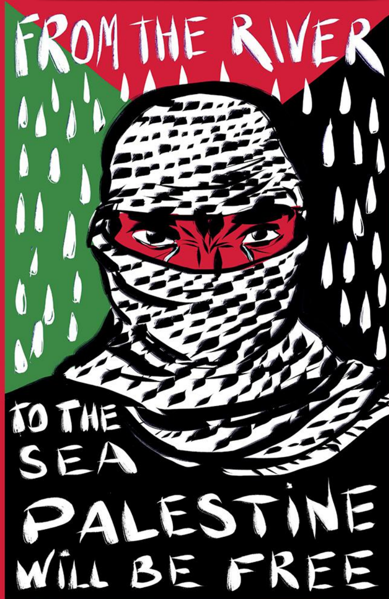
'From the river to the sea'.