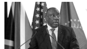
Cyril Ramaphosa, President of South Africa

Cyril Ramaphosa, the South African president has announced that efforts are underway to drag the State of Israel before the International Criminal Court (ICC) for genocide. He said the ongoing military action by Israel in Gaza has turned the Palestinian town into a concentration camp. He reiterated South Africa's position on the ongoing Israel-Gaza conflict stating that the world must unite to stop the carnage. "Gaza is now a concentration camp where genocide is taking place. "We have accordingly...referred this whole Israeli government operation