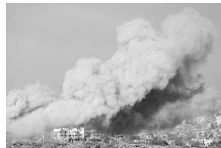
Smoke rises from Gaza on November 15. Belize's decision follows similar moves by fellow Latin American states Bolivia, Colombia, Chile and Honduras.

Belize has suspended ties with Israel due to its "indiscriminate bombing" of the Gaza Strip, the latest in a string of diplomatic rebukes of Tel Aviv. The Belize government announced on Tuesday that it was recalling its ambassador and retracting its request for accreditation for its honorary consul in Tel Aviv. Belmopan issued a statement denouncing the Israeli military's "unceasing" attacks on the besieged Palestinian enclave and blocking of aid. "The government of Belize has repeatedly condemned the actions of the [Israeli military] in Gaza", said the government statement. "We have appealed to Israel to implement an immediate ceasefire and to allow unimpeded access to humanitarian supplies into Gaza. "Despite our requests, Israel has not stopped its violations of