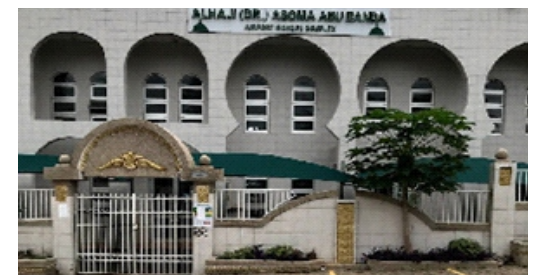
The Asuma Banda Mosque is also reported to be lined up for demolition