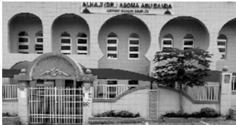
The Asuma Banda Mosque is also reported to be lined up for demolition

On the Asuma Banda's Mosque, the Railway Development Authority