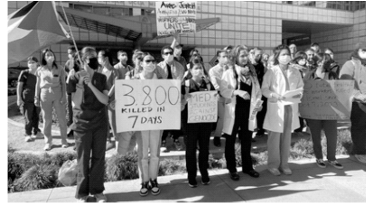
UCLA Med School November 9, 2023. Healthcare workers and medical students across the US have rallied to demand an end to Israel's genocidal bombing of Gaza and have especially condemned the attacks on health infrastructure and workers. Amid Israel's unprecedented attacks on healthcare workers and infrastructure in Gaza, the AMA censored a resolution proposed by its members to call for a ceasefire