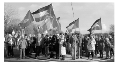
Activists mobilize protests at Shannon Airport, demanding an end to use of the airport to transport arms to Israel. Legislative proposals by left parties called the Irish government to hold Israel responsible for its genocidal war were voted down by the governing coalition in the Irish Parliament