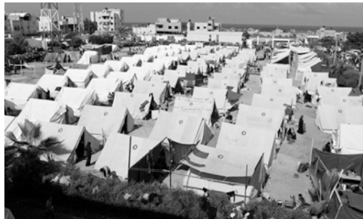
UNRWA camps in Khan Younis, Gaza. More than 103 workers of the UN refugee agency have been killed and over 60 of its camps sheltering displaced Palestinians have been bombed by Israel since October 7

Israel has been bombing Gaza's residents and civil infrastructure, including hospitals, since October 7, killing nearly 11,500 Palestinians and injuring over 29,000. It has also