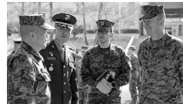
US and ROK Marines attend ceremony in South Korea. July 27 marked the 70th anniversary of the 1953 ceasefire to the Korean War. In the three years leading up to the anniversary, South Korean peace movements organized the international Korea Peace Appeal campaign to replace the armistice agreement with a peace treaty to conclude the 70-plus-year Korean War. The anniversary has come and gone, but, instead of peace, the Joe Biden, Yoon Suk Yeol, and Fumio Kishida administrations are...