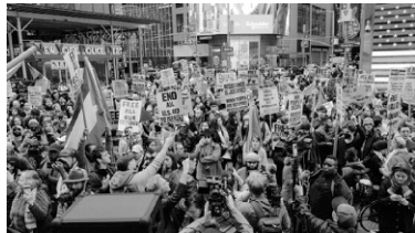
Thousands rally in Times Square in solidarity with Palestine. Peoples across the globe have organized rallies in support of Palestine as Israeli forces besiege the Gaza strip following Hamas' massive armed operation into Israel