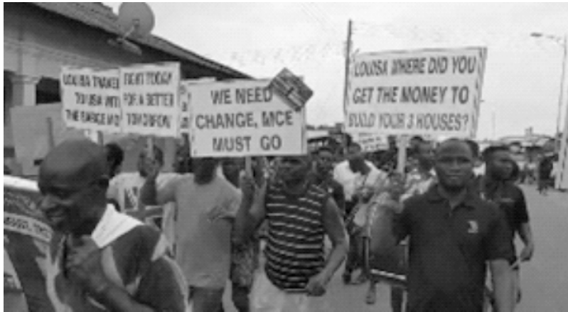
Residents of Jomoro demonstrate over missing Osagyefo Power Barge

On Monday, August 21, 2023, some angry residents of Jomoro Municipality of the Western Region, staged a mammoth demonstration against the government of Ghana over the disappearance of the Osagyefo Power Barge. The Osagyefo Power Barge is a 125MW barge-mounted gas turbine electric power generating station located at Effasu Mangyea in the Jomoro Municipality of the Western Region. The 125 MW power barge was ordered by the Ghanaian government in 1995 with financial assistance from the Economic