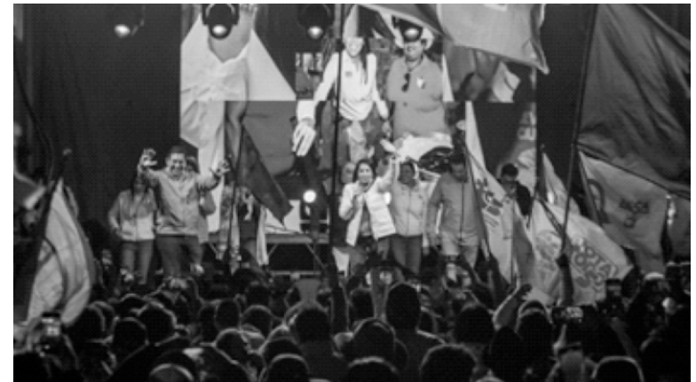
Luisa González of the left-wing Citizens Revolution Movement party (RC) won the first round of Ecuador's presidential elections held on August 20. González of the left-wing Citizens Revolution Movement won the first round with 33.31% of the votes, while Noboa of the right-wing National Democratic Action Alliance secured 23.66% of the votes

The Citizens Revolution Movement swept the legislative elections, obtaining 39.37% of the votes or 54 seats. However, the right-wing forces won the majority of seats in the