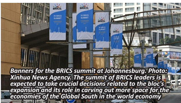
Banners for the BRICS summit at Johannesburg. The summit of BRICS leaders is expected to take crucial decisions related to the bloc's expansion and its role in carving out more space for the economies of the Global South in the world economy

The 15th leaders' summit of BRICS, an organisation of fast growing emerging markets and developing countries comprising Brazil, Russia, India, China and South Africa (BRICS) started at Johannesburg in South