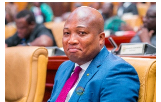
Samuel Okudzeto Ablakwa, MP for North Tongu