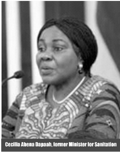
Cecilia Abena Dapaah, former Minister for Sanitation

are rather saying it is a donation from funerals. We have done a lot of funerals in this country, funerals do not generate that kind of money.