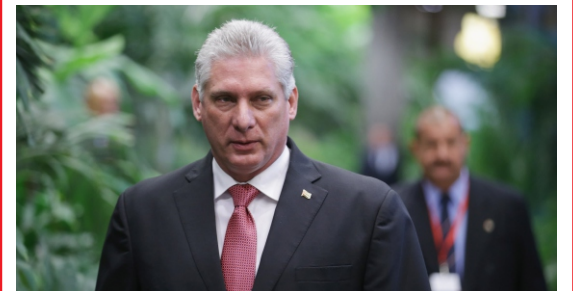
Miguel Diaz Canel, Cuban President

T he Socialist Movement of Ghana (SMG) has praised the Cuban people's resistance against imperialism and their efforts to build a just society. In a statement on the 70th anniversary of