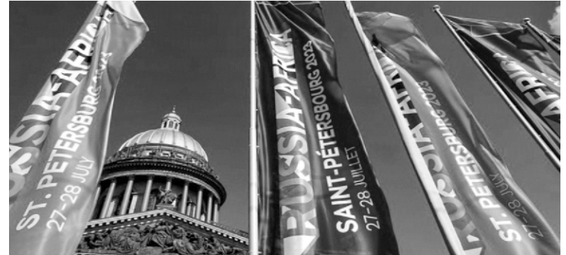
At least 49 African countries are taking part in the Russia-Africa summit that began in St. Petersburg on July 27. The food sovereignty of African countries is likely to be high on the agenda and the summit will try to finalize the establishment of a new grain deal fitting their needs

Russia is facing criticism from the West after it announced the termination of the grain deal signed with Ukraine in July last year. The deal, mediated by the UN and