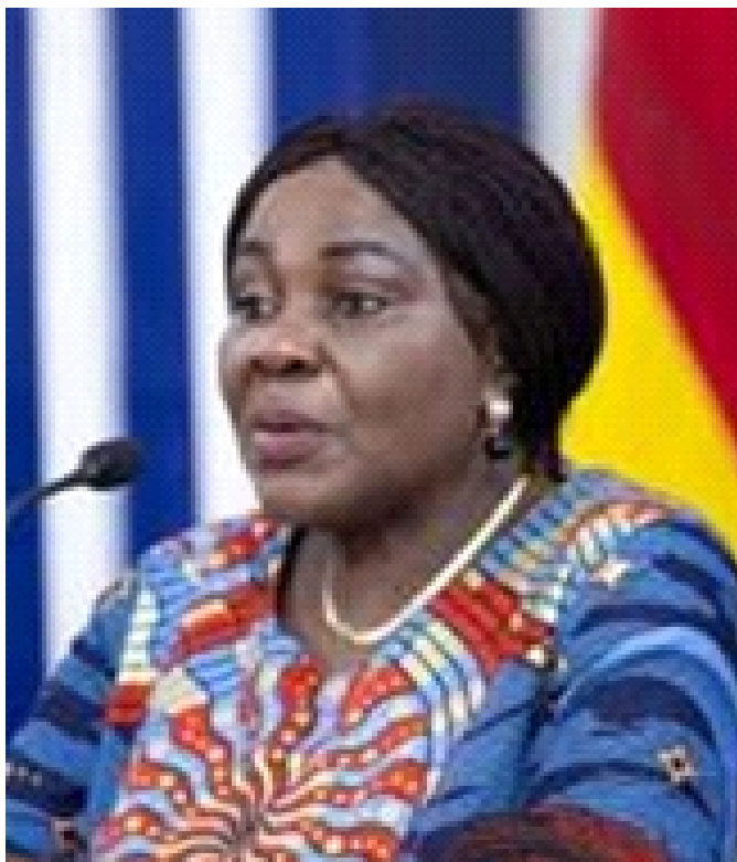
Cecilia Abena Dapaah, former Minister for Sanitation