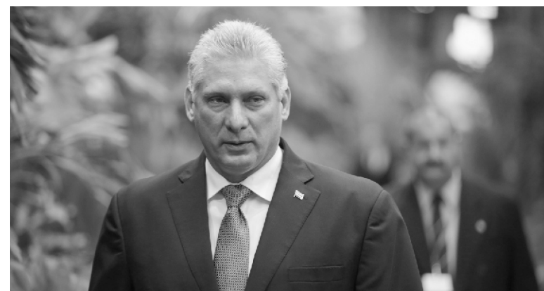
Miguel Diaz Canel, Cuban President

We recognize the immense significance of the Cuban Revolution, which is rooted in the values of international solidarity and an anti-capitalist mode of organizing the necessities of humanity such as food, cloth, shelter, and healthcare. The United