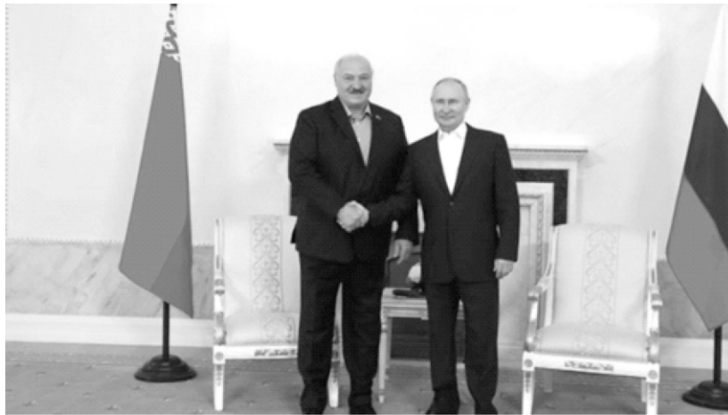
Russian President Vladimir Putin (R) met Belarus President Alexander Lukashenko, St. Petersburg, July 23, 2023. President Vladimir Putin's video conference with the permanent members of the Security Council in Moscow last Friday and his meeting with Belarus President Alexander Lukashenko in St. Petersburg on Sunday provide glimpses into Russia's perspective at this point of time

Certainly, Russian President Vladimir Putin's video conference with the permanent members of the Security Council in Moscow last Friday and his meeting with Belarus President Alexander Lukashenko in St. Petersburg on Sunday were defining moments. The two transcripts stand back-to-back and need to be read together. There is no question that the two events were carefully choreographed by the Kremlin officials and intended to convey multiple messages. Russia exudes confidence that it has achieved dominance on the battle front — having thrashed the Ukrainian military and Kiev's “counteroffensive” moving into the rear view mirror. But Moscow anticipates that the Biden administration may be having an even bigger war plan in mind. At the Security Council meeting, Putin “de-classified” the intelligence reports reaching Moscow from various sources indicative of moves to insert into Western Ukraine a Polish expeditionary force. Putin called it “a well-organized, equipped regular military unit to be used for operations” in Western Ukraine “for the subsequent occupation of these territories.”