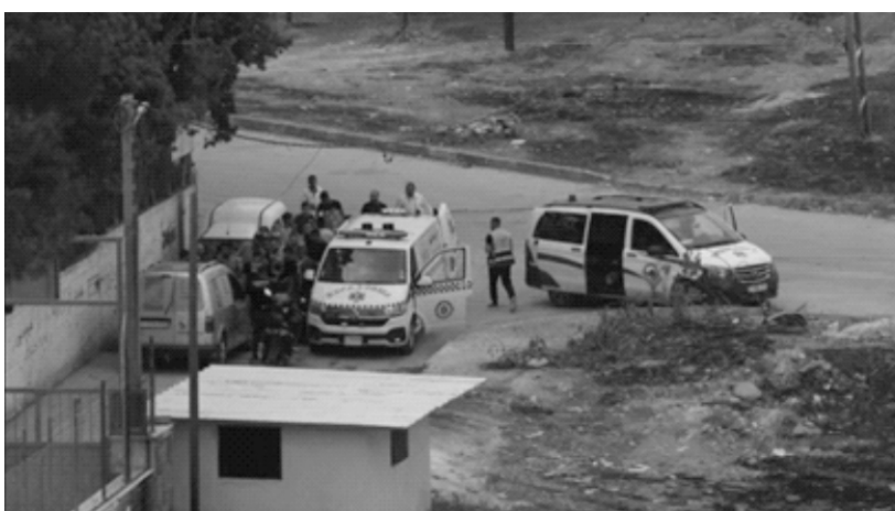
Injured Palestinians are taken to hospital onboard ambulances as Israeli forces raid Jenin on June 19, 2023. Close to a 100 Palestinians were wounded in the raid. Israeli forces shot at ambulances and paramedics and tried to prevent them from reaching the injured and providing medical attention

Israeli security forces have conducted a massive raid in the city of Jenin in the occupied West Bank killing five and wounding others. Latest reports state that at least five Palestinians were killed