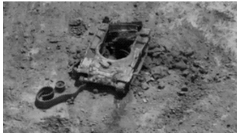
Russian President Vladimir Putin: Kiev has lost 186 tanks, 418 armored vehicles, losses mounting, St. Petersburg, June 16, 2023. NATO expected the Ukrainian forces to punch through key Russian fortifications by now. In reality, they are struggling to get anywhere near the sprawling layered fortifications and in that desperate attempt, are taking massive losses

Indeed, this is all bluster. The idea of Poland "putting boots on the ground" is so patently absurd. The Polish military will wither away in a confrontation with Russia. But what such theatrics show is that nerves are on edge as the specter of defeat in Ukraine is endangering NATO's unity. So, Jens Stoltenberg, NATO secretary-general, stepped in to