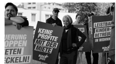
The Communist Party of Austria claims that the average housing cost in the country has increased by 12% over the past two years. The party has called for measures such as expansion of municipal housing and introduction of building rent caps

forth by the KPO to tackle this crisis include: 1) expansion of the existing municipal housing and cooperative housing facilities and putting an end to their privatization, 2) introduction of binding rent caps which will cover a maximum of the rental facilities available in the market and ensuring that housing costs do not exceed over a quarter of the income, 3) abolition of fixed-term leases and capping of value retention clauses, 4) expropriation and re-municipalization of large real estate companies. The ongoing cost of living crisis triggered by the war in Ukraine and profiteering by multinationals has exacerbated the housing crisis in several countries in