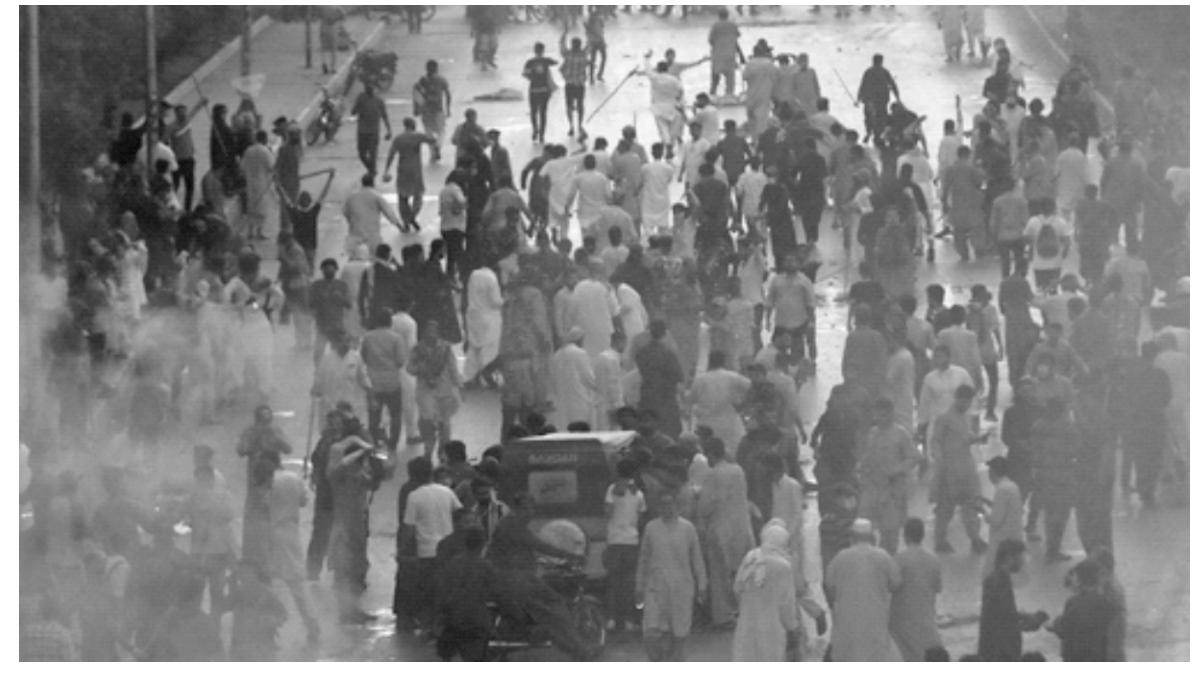
Protests in Karachi, Pakistan after the arrest of former Prime Minister Imran Khan. Imran Khan, who was arrested on Tuesday, was sent into custody of the National Accountability Bureau on Wednesday. He was also indicted separately in a case related to do with illegal sale of gits. Protests have broken out and are growing across the country with over a 1,000 people arrested.

assive protests are continuing in Pakistan after the arrest of former Prime Minister Imran Khan last Tuesday. On Wednesday, a court sent the leader of the opposition Pakistan Tehreek-e-Insaf (PTI) into eight days of detention with the National Accountability