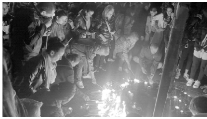
Serbs pay homage to the victims of a mass shooting at a Belgrade school. Gun ownership in Serbia is among the highest in Europe and a massive proliferation of small arms took place in the country and in around the Balkans during the civil wars in the 1990s which led to the disintegration of the erstwhile Yugoslavia.

car in the village of Dubona, south of Belgrade. Eight people were killed and 14 were injured. After an extensive manhunt, police reportedly arrested the culprit by Friday morning. On Wednesday, a 13-year-old boy shot dead 8 fellow pupils, as well as a security guard at the Vladislav Ribnikar Elementary School in Belgrade. In the aftermath of the shooting, Serbian President Aleksandar Vucic called for tight restrictions on gun ownership in the country. Gun ownership in Serbia is among the highest in Europe and according to reports, as per an estimate in 2019, there are 39.1 firearms per 100 people in