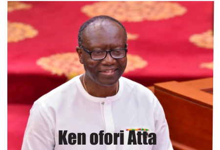
Ken Ofori Atta

Cedi To Depreciate Against US Dollar By 30% In 2023 – EIU