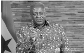
Former President of Ghana, John Dramani Mahama

F ormer President, John Dramani Mahama, has said completing abandoned projects scattered across the country will help protect the public purse. He said a National Democratic Congress (NDC) government in 2025 would not rush to start new projects while existing ones were uncompleted, "We are going to take the ongoing projects that we were doing that they abandoned." He said all the E-blocks, the hospitals, the roads, electrification, GETfund projects including the ongoing projects that might not be finished would be completed. "When we say we will protect the public purse, we mean it, and one way of protecting the public purse is to finish these abandoned projects," the Former President, who is a Flagbearer hopeful for the NDC, told delegates in Sandema. Prior to the campaign durbar in Sandema, Mr Mahama addressed a similar gathering