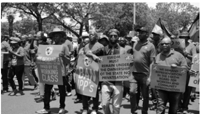
The Court has granted urgent relief sought by NUMSA and 18 other applicants to exempt public hospitals, schools, and police stations from rotational power cuts, recognizing that load shedding infringed upon constitutional rights. A decision on Part B of the application seeking final relief is awaited.

In a crucial ruling last Friday May 5, the North Gauteng High Court in Pretoria decided in favor of the National Union of Metalworkers of South Africa (NUMSA) and 18 other applicants seeking relief from severe power outages that have affected much of the country. It ordered the Minister of Public Enterprises to take "all reasonable steps" within 60 days to ensure that there is sufficient supply or generation of electricity to prevent any interruption due to load shedding to all public health establishments, all public schools, and the South African Police