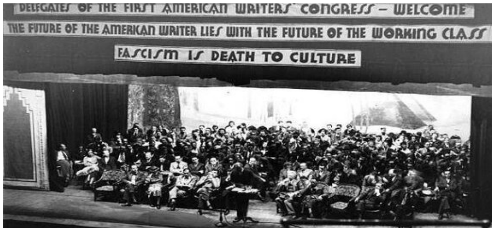
The Congress of American Writers that was held in New York City took a firm stand against fascism and war.