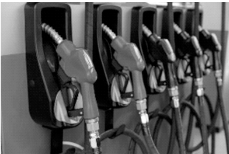
File photo a fuel pump

The National Petroleum Authority (NPA) has cautioned fuel retail outlets and motorists against using ramps to aid the pumping of fuel into vehicles. It said tilting vehicles on ramps to fill them to the brim could damage fuel tanks – leading to explosions and destruction of vehicles and lives. The Eastern Regional Manager,