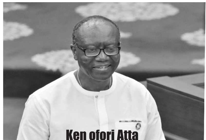
Ken ofori Atta

As of May 2, 2023, the cedi is selling at GH₵12.10 pesewas to the dollar on the forex or retail market while the British Pound is selling at GH₵15.20 and the Euro going at GH₵13.40.