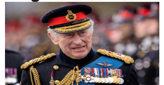
King Charles III. Not everyone is happy with the invitation to swear allegiance to their new king.

'It Feels Like Game Of Thrones': Call To Swear Allegiance To King Branded 'Feudal'