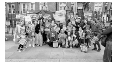
Health workers at a picket line during a nurses' strike in England. Nurses, ambulance workers, and other health workers in England continue to plan for industrial action escalation as government looks for way to stop strikes without improving working conditions