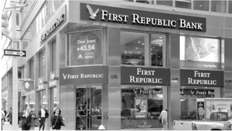
First Republic is the third bank to fail in the US since March. First Republic Bank, holding USD 233 billion in assets, collapsed and was sold to banking giant JP Morgan Chase. First Republic is the third bank to fail in the US since March, surpassing the spectacular failure of Silicon Valley Bank (SVB) on March 10

On International Workers' Day, the First Republic Bank became the second largest bank to fail in US history. The USD 233 billion institution was seized by the government and sold to banking behemoth JP Morgan Chase. First Republic is the third bank to fail in the US since March, surpassing the spectacular failure of Silicon Valley Bank (SVB) on March 10. SVB's depositors were bailed out by the US government to the tune