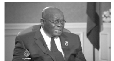
Nana Addo Dankwa Akufo-Addo