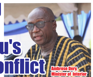
Ambrose Dery, Minister of Interior