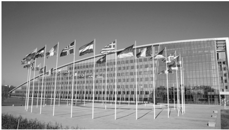
In 2022, NATO powers allocated huge sums to Ukraine—about $50 billion from the US, €52 billion from the EU and its member states, and £2.3 billion from Britain. Europe desperately needs an independent foreign policy, and this notion is gaining support as the economic crisis across the region deepens