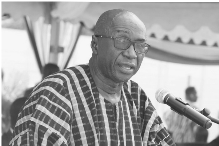
Ambrose Dery, Minister of Interior