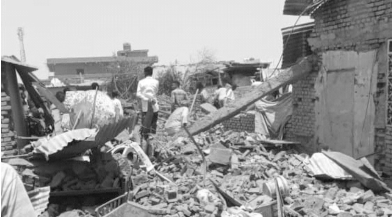
According to the World Health Organization (WHO), 3,700 people have been injured since fighting broke out on April 15. The humanitarian crisis, including mass displacement, has continued to worsen as multiple ceasefires have failed to hold

At least 427 people have been killed as clashes between the Sudanese Armed Forces (SAF) and the paramilitary Rapid Support Forces (RSF) entered their ninth consecutive day on Sunday, April 23. In a statement on Monday, April 24, morning, the Sudan Doctors Union (SDU) reported that various areas of the capital Khartoum were being bombarded, which had resulted in civilian deaths in the Kalakla area. It added that a hospital, already overcrowded with people with serious injuries, had also been hit with the number of people injured reaching 50. According to the World