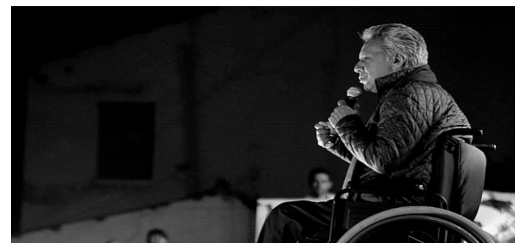
Ecuador's State Attorney General's Office requested the preventive detention of former President Lenín Moreno on April 19, in the Sinohydro case. Moreno is accused of receiving bribes for the construction of the country's largest hydroelectric plant when he was serving as Ecuador's vice president

appear periodically led the Public Ministry to seek his preventive imprisonment, along with others. The hearing to review the request will be held next week. In February, the Attorney General's Office reported that the investigation into the Sinohydro case, formerly known as the INA Papers case, revealed a structure of corruption around the Coca Codo Sinclair hydroelectric project. It disclosed that between 2009 and 2018, the Chinese state company Sinohydro paid around $76 million USD in bribes to the accused for the construction of the plant. The Sinohydro case was opened in March 2019, when media outlet La Fuente published an investigative