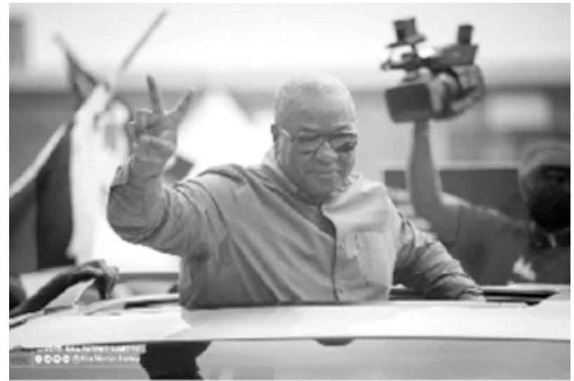
John Dramani Mahama, Former president