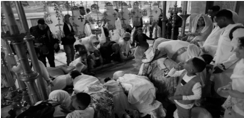
The Greek Orthodox Church in occupied East Jerusalem asked Palestinians to defy restrictions imposed by the Israeli occupation forces ahead of Orthodox Easter which was celebrated on April 16

After repeatedly attacking Muslim worshippers inside the Al-Aqsa mosque compound over last couple of weeks during Ramadan, the Israeli occupation forces imposed restrictions on Easter festivities at the Church of the Holy Sepulchre in occupied East Jerusalem, leading to strong objections from Christians in Palestine. Citing security concerns, the Israeli forces restricted the