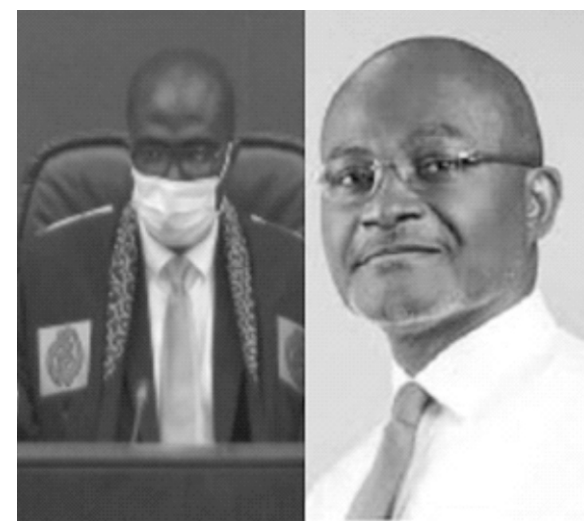
2nd Deputy Speaker of Parliament Andrew Asiamah Amoako (left), MP Ken Agyapong (right)

“I spoke to the Adansi Fomena NPP chairman and he told me that he will have resigned but a rural bank, he owes GH¢1.5 million will take him to court if he is no longer the chairman of the party in the constituency,” he said in Twi.