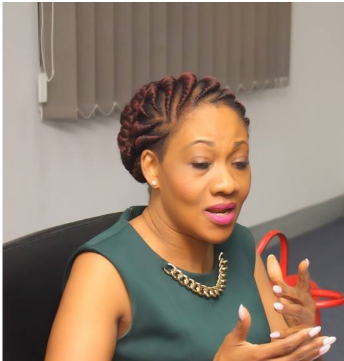
Jean Mensa, EC Chairperson

...Calls On Electoral Commission To End Unlawful Practice