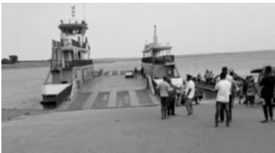
Both ends of the river banks are overwhelmed with traders, cargo vehicles and ambulances

Tension is mounting among commuters from Adawso to Ekye Amanfro in the Eastern Region as the ferry which transports passengers on the Afram River has developed a mechanical fault. Speaking to some drivers on