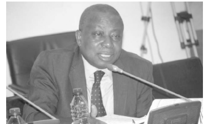
Kwaku Agyeman-Manu, Minister of Health

Indeed, it is crucial to be concerned about the persistence of this mosquito species, as it could potentially lead to a surge in the mosquito population within our country. This, in turn, heightens the risk of malaria transmission. To mitigate this risk, we must take proactive measures to implement effective environmental management practices. The presence of a robust mosquito species, such as Anopheles stephensi , that can thrive in water sources and withstand harsh environmental conditions, poses a significant concern. If this species becomes established in the local mosquito population, it is likely to result in an increase in overall mosquito numbers. This, in turn, could lead to a