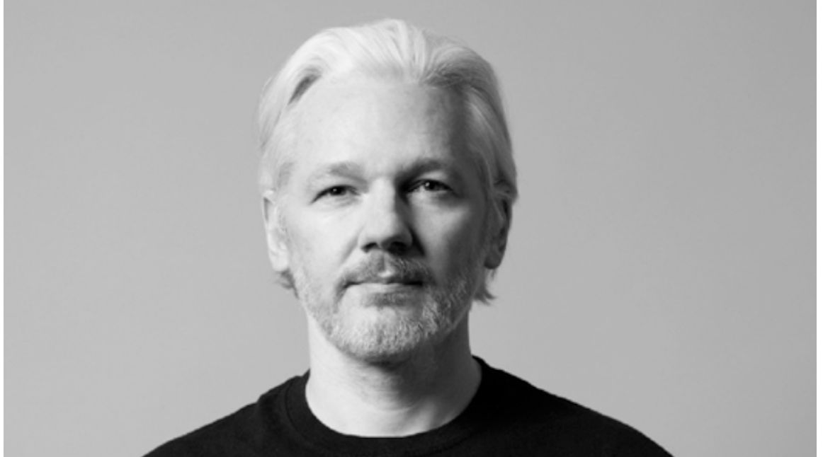
Once extradited, Assange will face an indictment for charges that carry a total maximum prison sentence of 175 years. The Wikileaks founder has spent four years in a high-security prison without a conviction or a charge, fighting a prolonged extradition process. Meanwhile, his supporters have shown no signs of easing the struggle for his release

The letter is a rare Congressional effort calling for Assange's release and has gained only a very limited support from within the Congress. Nevertheless, it has generated a great deal of interest among activists, who see it as an