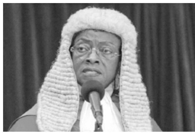
Immediate past Chief Justice of the Supreme Court of Ghana, Sophia Akuffo

ophia Akuffo, a former Chief Justice of the Supreme Court of Ghana, has reacted to the brouhaha surrounding the appointment of three new commissioners of the Electoral Commission of