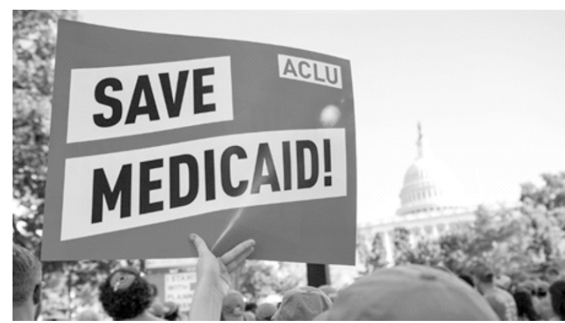
From a demonstration in front of the US Capitol building in 2017. Millions are to lose Medicaid/CHIP benefits in the coming months as prepandemic income eligibility restrictions have returned

s US-based news is inundated with coverage surrounding the spectacle of former president Donald Trump's arraignment, 15 million people are being quietly phased out of receiving Medicaid and Children's Health Insurance Program (CHIP) benefits, beginning April 1 and going through May and July. As the Joe Biden administration will end the COVID-19