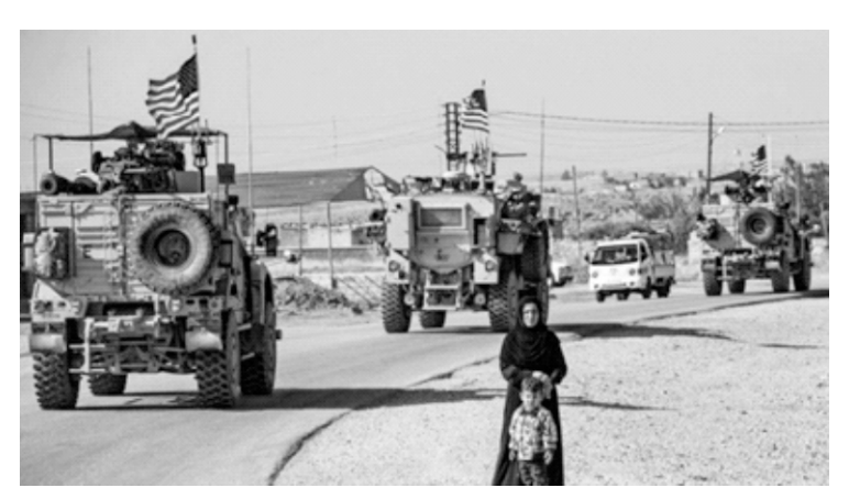
A convoy of US armored vehicles patrolling the occupied territories of northeastern Syria bordering Turkey. (File photo). The specter that is haunting Washington is that the stabilization of Syria following Assad's normalization with the Arab countries and with Turkey will inexorably coalesce into a Syrian settlement that completely marginalizes the "collective West"

It is entirely conceivable that Erdoğan has sought Putin's help and intervention to reach a modus vivendi with Assad quickly. Of course, this is a spectacular success story for Russian diplomacy—and for Putin personally—that the Kremlin is called upon to broker