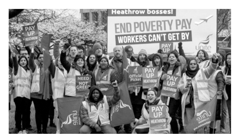
Picket outside Heathrow airport. (Photo: Mark Thomas Photos via Unite the Union). Security guards affiliated to Unite the Union started a 10-day strike action on March 31 after last ditch talks with the airport authorities for a pay rise failed

he 10-day strike action initiated by security guards at Heathrow Airport—the UK's busiest—entered its fourth day on Monday, April 3. Around 1,400 security staff at the airport affiliated to Unite the