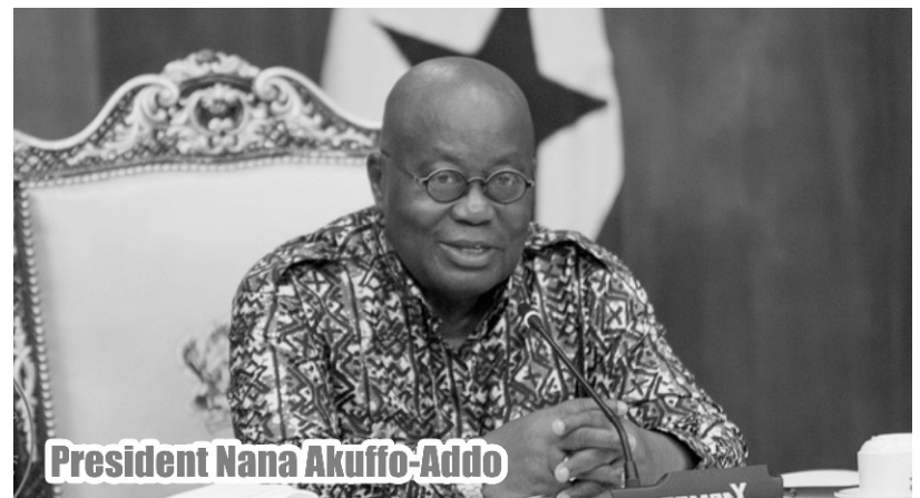
President Nana Akufo-Addo

Under the agreement allowing the US army to operate from Ghana, US soldiers have more privileges than Ambassadors and High commissioners under the Geneva Convention. They don't need visas and passports to come to Ghana. All they need is their US army