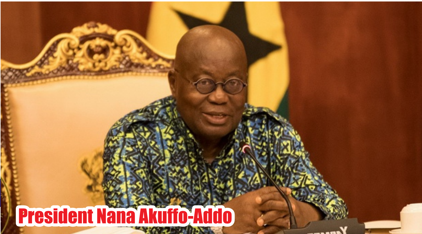
President Nana Akufo-Addo