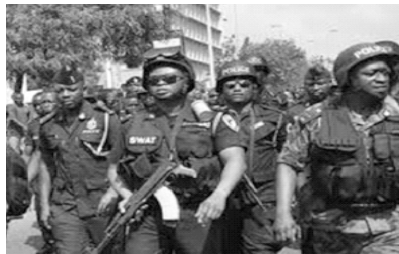
Correspondence from Upper West

emergency in this town? "We are now in the warmest time of the year and the weather here is always hot even at night. So most people look for some fresh air at night before going to sleep. But these members of the Police Anti-Armed Robbery Squad would often visit such neighborhoods sitting in relaxation and start assaulting, whipping people with their cutlasses and asking them to go inside and sleep as though the town was having a curfew of a sort. When we ask questions, they usually claim the commander here has no control over them unless only the IGP. They are always terrorising the people other than protecting them. How can the Police go on an operation in town without wearing uniform but are spotted wearing ear rings, dreadlocks, beard, masks and so on? We are calling on the IGP to remove them from the region as the regular Police officers here can protect us and provide order for the people," another resident, Isaac Kofi registered his frustration to GhanaWeb. Saaka Mahama also bemoaned, "It's disheartening and disgusting to say the least, how these officers are treating people in Wa. These Anti-Robbery unit guys treat people like animals. Before the recent killing of Shahid who everybody in town know as a good mannered person,