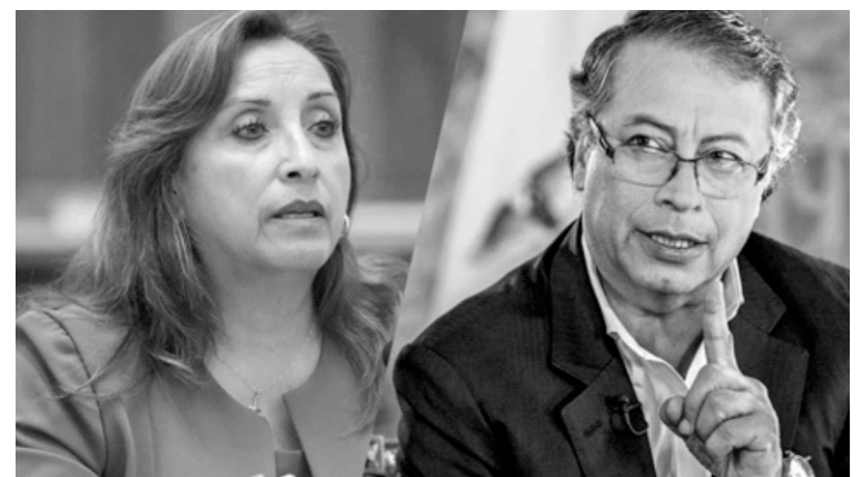
Peru's de-facto President, Dina Boluarte has withdrawn Peru's ambassador from Colombia following statements from Colombian President Gustavo Petro in support of ousted Peruvian President Pedro Castillo. The decision came days after Colombian President Gustavo Petro lamented former Peruvian President Pedro Castillo's absence at the Ibero-American Summit

general elections by the end of the year, and a referendum on a constituent assembly to draft a new constitution. In February, the plenary of Congress, with 72 votes in favor, 29 against and 7 abstentions, approved a motion declaring Gustavo Petro a 'persona non grata' after he criticized the response of the Peruvian National Police to the ongoing social protests. The Parliament recommended the Interior and Foreign Ministries “carry out the necessary actions so that Gustavo Petro does not enter the national territory.” The Peruvian Foreign Ministry added in the statement on Wednesday that Petro's behavior has damaged the diplomatic relations between the neighboring countries. In the past months, the Boluarte government also announced the definitive withdrawal of the Peruvian ambassadors to