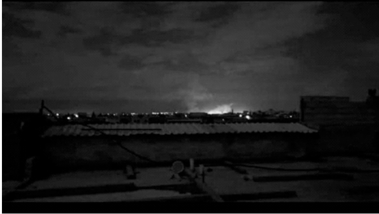
File photo. (Photo: Press TV). This is the second such strike on Syria in the past week. Israeli airstrikes on the Aleppo airport in recent weeks have caused delays in relief delivery to earthquake-affected regions in Syria

Israeli warplanes launched fresh airstrikes near Syrian capital Damascus in the early morning of Thursday, March 30, injuring two Syrian soldiers and causing damage