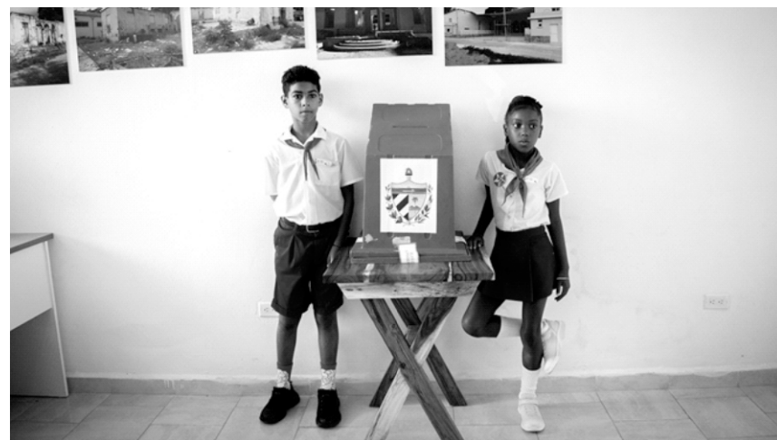
Children part of the youth organization José Martí Pioneers volunteer to watch the Cuban polls during the November 2022 municipal elections. Republican politicians want to keep Cuba on the State Sponsors of Terrorism unless Cubans "transition away from the Castro regime"

Criticisms of the Cuban electoral process that originate from Washington or Miami often point to the lack of campaigning or the fact that candidates run unopposed, as well as claims that the Communist Party dominates the political system. However, the cycle of endless campaigning in the United States often ensures that only those with the most disposable income