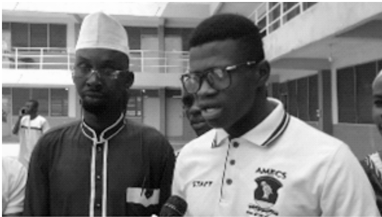
Some students of Tamale Technical University

There is growing tension at the Tamale Technical University (TaTU) after a week-long protest against plans by the management of the university to increase school fees by 15 percent intensified last Friday, March 17, 2023. The Students' Representative Council of the university announced a total boycott of all academic activities “with immediate effect” on Friday morning, adding that it will