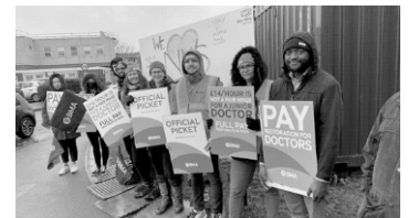
Junior doctors in a picket line on March 13, 2023. Tens of thousands of junior doctors walked off their jobs across England as part of a 72-hour strike in an attempt to secure pay restoration and improvement of working conditions

their support even as they faced severe disruption to health services and senior doctors were called to take on the care roles usually carried out by junior colleagues. From his side, the health secretary said junior doctors' demands would cost £2 billion (USD 2.4 billion) to fulfill and thus are "simply unaffordable." But most people in England feel the NHS is worth protecting and investing in. Thousands of activists, patients, and health workers took to the streets of London a couple of days before the beginning of the strike in a "SOS NHS" protest. In addition to expressing