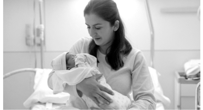
The numbers from a report by UN agencies indicate that after progress had been made in the period from 2000 to 2015, maternal mortality indicators stagnated in the four years that followed

global number of maternal deaths, with 82,000 women losing their lives at childbirth or during pregnancy. In other regions, like in West Asia and North Africa, indicators improved, but the experience of women living in situations of conflict and occupation marred the progress achieved. For example, the maternal mortality ratio in Palestine decreased from 62 to 20 between 2000 and 2020. In Israel, the ratio went from nine to three in the same period, illustrating the extreme differences in access to health care for those living under Israeli occupation. By allocating more resources for nutrition, sexual and reproductive health services, and