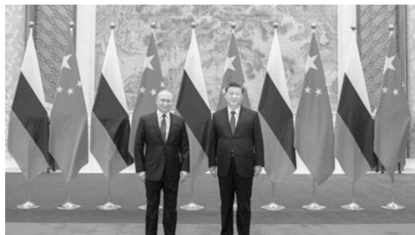
Vladimir Putin and Xi Jinping in a meeting in February 2022. The Anglo-Saxon clique is watching with dismay the talks in Moscow between Xi Jinping and Vladimir Putin. To be sure, Moscow and Beijing have decided to stand together to bury the US hegemony

By the way, there has been no referral by the UN Security Council or General Assembly to the ICC. So, who organized this arrest warrant? Britain—who else? The Brits bullied the ICC judges who are highly vulnerable to blackmail, as they draw fat salaries and would sup with the devil if it helped secure extended terms for them at the Hague. This becomes yet another case study of the piecemeal destruction of the UN system by the Anglo-Saxon clique in the recent years. Suffice to say, the drone incident and the ICC warrant vitiate the climate for any dialogue between Moscow and Kiev. Evidently, the Anglo-Saxon clique is worried like hell that China might spring another surprise as it did by mediating the recent Saudi-Iranian deal. In a meaningful remark, the Chinese Foreign Ministry spokesperson Wang Wenbin said on Friday that Xi's visit is partially to promote “peace.” Beijing has already released a “peace plan” for Ukraine , a 12-point agenda for “a political resolution of the Ukraine crisis,” which is on Zelensky's desk in Kiev although the West studiously chose to ignore it. In a phone call on Thursday, Chinese Foreign Minister Qin Gang told his Ukrainian counterpart Dmytro Kuleba that Beijing hopes “all parties will remain calm, rational and restrained, and resume peace talks as soon as possible.”