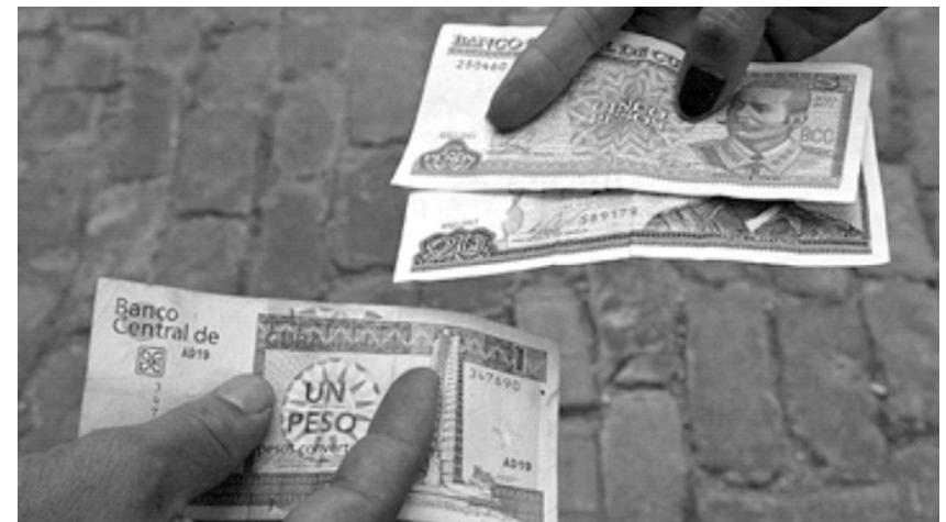
Cuban pesos in Havana. Understand the legal dispute involving a vulture fund and the Cuban National Bank that may impact international law and economics