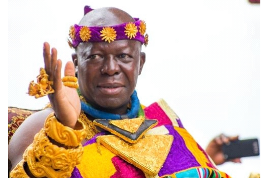
Asantehene, Otumfuo Osei Tutu II

Asantehene Sends Strong Message to Akufo-Addo Over Economic Hardship