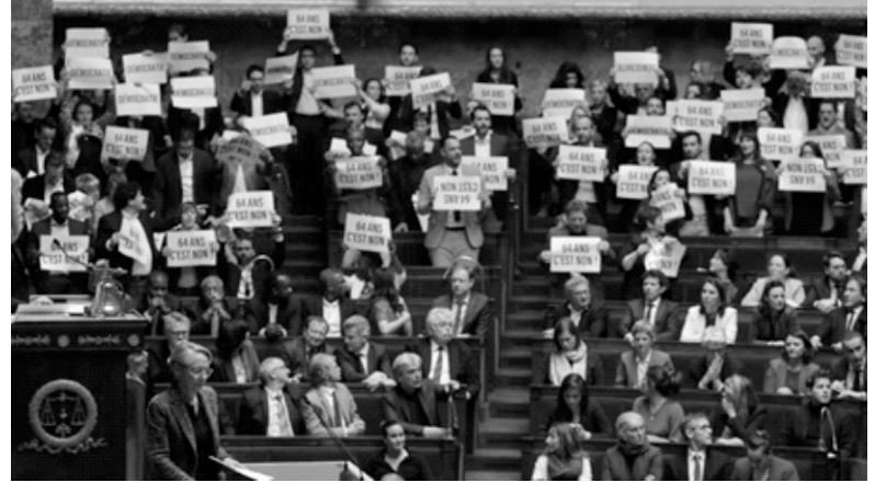
Mps from the left-wing NUPES coalition protesting against Prime Minister Elisabeth Borne in French parliament. Left-wing opposition parties and trade unions have slammed the reform as anti-worker and illegitimate and called to continue protests

Thursday invoked the emergency provision Article 49.3 of the Constitution in the parliament and passed a controversial pension reform, bypassing the parliamentary vote. The decision announced by Prime Minister Elisabeth Borne to avoid voting on the