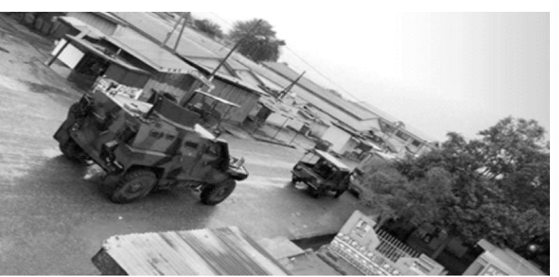
Armored military vehicles in Ashaiman during a brutal military operation on March 7. (Photo: via social media). One person is reported to have died days after Ghanaian soldiers invaded Taifa, brutalizing residents and arresting 184 people. The military claimed that the raid was an "intelligence-led operation" in response to the alleged killing of a soldier in the area

The incident has raised questions about the military's deployment and jurisdiction in matters of "internal security," and why an "intelligence-led operation" saw this level of mass violence in the first place. The classification of certain areas, especially areas housing urban poor communities, as "crime-prone" also raises concerns—and this is not specific to Ghana-given that such language is often used to justify state violence, including heavily militarized forms of policing, or, in the case of Ashaiman, direct military action. "The use of military force against civilians is a clear violation of Ghana's Constitution, which protects the right to life, freedom from torture, and the right to a fair trial. Military personnel are bound by these laws and must be held accountable for any violations they commit," the Accra Collective of the Socialist Movement of Ghana (SMG) said in a statement. Speaking to the government's refusal to condemn the violence, SMG General Secretary Kwesi Pratt Junior added, "I heard a minister complaining that in the past we used to fear the soldiers and policemen and