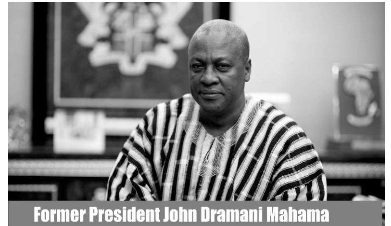
Former President John Dramani Mahama

"With that, when voting ends at 5 pm, we will be able to declare our victory by midnight. We would