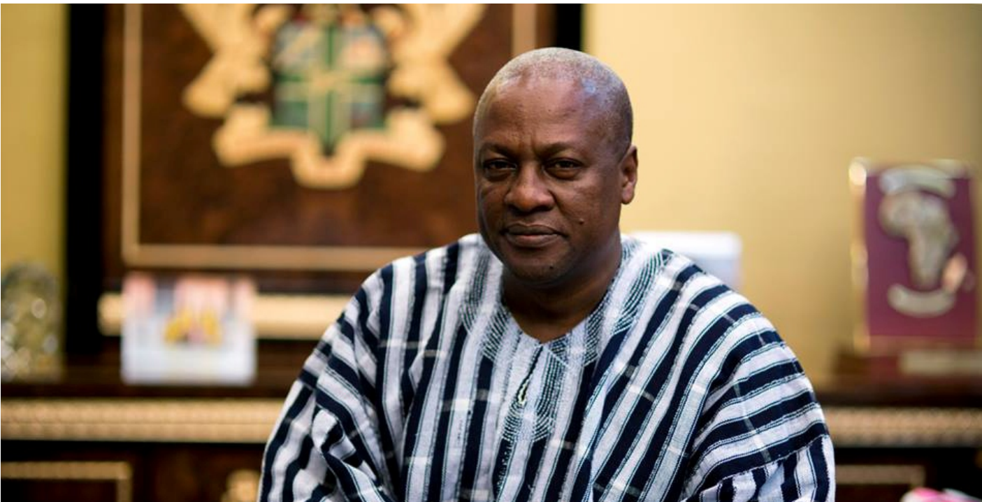
Former President John Dramani Mahama