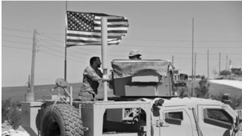
US troops deployed in Syria. The US has built an illegal base and deployed nearly 900 soldiers in Syria, who have allegedly helped prolong the war in the country and facilitated the loot of its natural resources

A resolution asking for the complete withdrawal of US troops from Syria within six months was defeated last Wednesday, March 8, in the US House of Representative despite drawing bipartisan support.