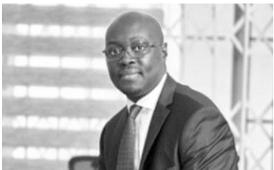
Cassiel Ato Forson, Minority Leader and former deputy Minister of Finance

M inority Leader in Parliament, Cassiel Ato Forson last Wednesday took under two-minutes to sternly critique president Nana Addo Dankwa Akufo-Addo's State of the Nation Address (SoNA) delivered on March 8.