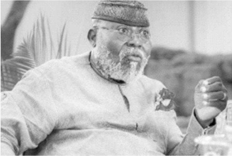
Dr Nyaho Nyaho-Tamakloe, a leading member of the New Patriotic Party

D r Nyaho Nyaho-Tamakloe, a leading member of the New Patriotic Party , has called on the Minister for Defence, Dominic Nitiwul , to resign or be