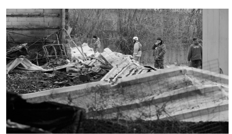
In a 12-point proposal, China criticized Western sanctions on Russia and asked the world community to shed its "cold war mentality" and address the "security interests and concerns" of all countries involved

China also criticized all unilateral sanctions imposed by the US and the EU on Russia, saying that such