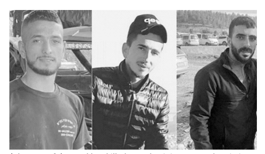
Israel has killed 10 Palestinians around Jenin in just three days, taking the total number of Palestinians killed since the start of this year to 78, which includes 14 children

n continuing their murderous act of killing spree in the occupied Palestinian territories, Israeli occupation forces have killed three more Palestinians early on Thursday, March 9, in the town of Jaba near Jenin in the