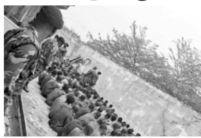
72 people have so far been arrested after the operation

he Military High Command gave the greenlight for an operation that took place in Ashaiman, a suburb of Accra, on March 7, 2023.