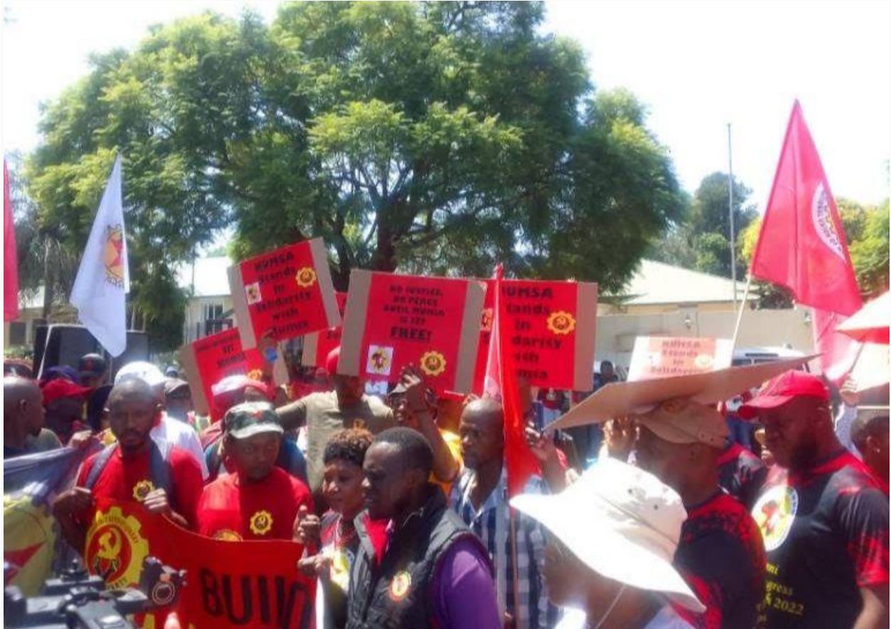
NUMSA and SRWP marched to the US embassy in Pretoria, South Africa to demand freedom for US political prisoner Mumia Abu-Jamal, 10 March.