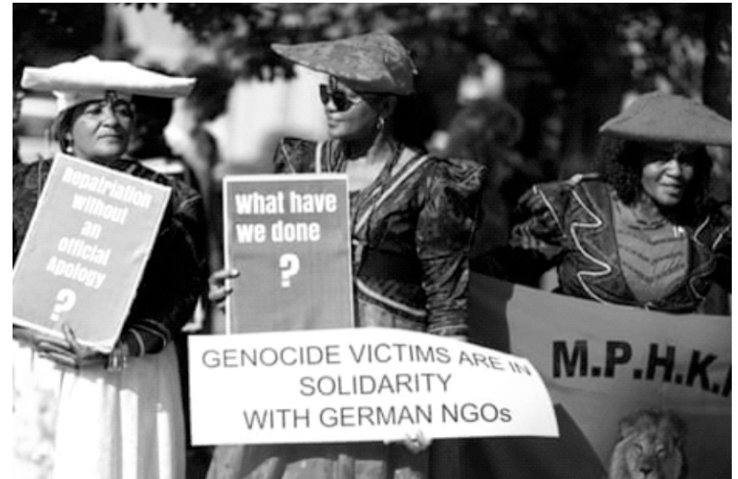
Protesters outside a ceremony in Berlin in 2018 to hand back to Namibia the remains of Herero and Nama people killed in the 1904-1908 genocide. Herero and Nama people demand direct talks and take Namibian government to court for accepting reparations on their

A spokesperson for the German foreign office said only the Namibian government had the mandate and “democratic legitimacy” to negotiate with Germany, but the federal government had sought the voices of the descendants of victims, including through an advisory committee of five people who worked with the Namibian negotiator, who was himself Herero. “The federal government calls the crimes committed against the Herero, Nama, Damara and San by their name: genocide. The fact that we use this term in its historical rather than its legal sense is because the