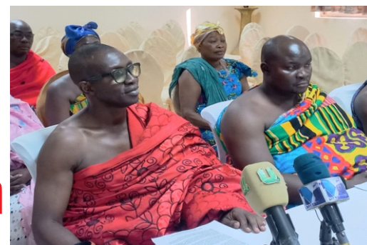
The member of Ahanta Traditional Council at the press conference