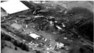
For unionized rail workers, the train derailment exposes systemic failures in a railroad system that is driven by profit, not safety. (Image via the Environmental Protection Agency). After 50 derailed train cars caused a massive fire and led to the release of toxic fumes into the air, workers argue that corporate cost-cutting was the culprit

Norfolk Southern freight train has derailed in the town of East Palestine, Ohio. 50 out of 100 train cars ran off the tracks, igniting a massive fire that could be seen from miles away. Governor Mike DeWine of Ohio issued an evacuation order on February 5, due to the possibility of a major explosion. Local community members and activists across the country have sounded the alarms regarding the impacts the incident could have on public health and environment. Many have pointed to reports of animals dying en masse as evidence. Yet, despite the public outcry over the environmental and public health catastrophe, the actions of Ohio authorities reflect an attitude of concealment.