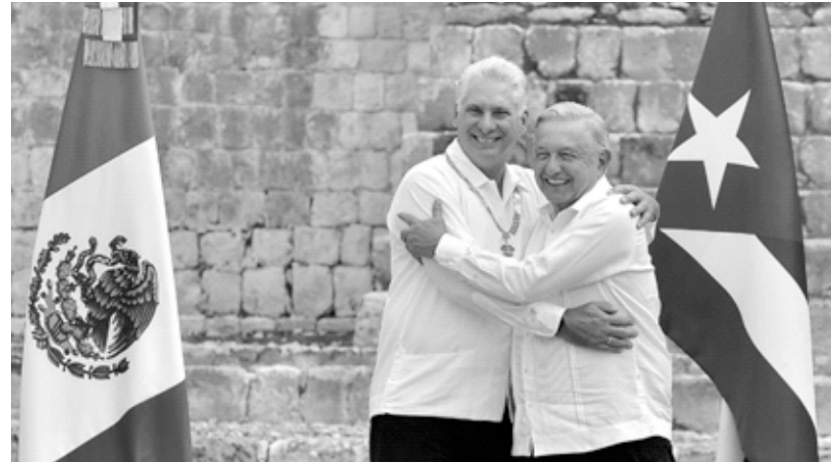
Mexican President Andrés Manuel López Obrador has awarded Cuban President Miguel Díaz-Canel Mexico's highest medal of honor for foreigners, the "Order of the Aztec Eagle," for his work in strengthening relations between the two countries.

combination of the impacts of nature and the effects of the intensified blockade," said Díaz-Canel. The Mexican president also thanked his Cuban counterpart for sending doctors to Mexico, some of whom serve in dangerous or remote areas. Over 600 Cuban doctors and specialists are working in 12 Mexican states. López Obrador announced that, during 2023, more Cuban professionals could join this health program. Meanwhile, the Cuban president explained that in May 2022, during President AMLO's visit to Cuba, "we agreed that both countries could send specialists to provide public health services in health units or institutions of our respective nations. In less than a year, we are complying with what was agreed on and there are already results to show." Díaz-Canel added that the two