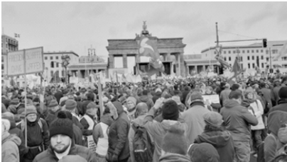
Anti-war rally in Berlin. On the one year anniversary of the state of the war, Berliners took to the streets to demand deescalation and peace

Tens of thousands of people last Saturday rallied at the Brandenburg Gate in Berlin demanding that German Chancellor Olaf Scholz take an active role in encouraging negotiations to end the ongoing war in Ukraine. The mobilization with the slogan 'Uprising for Peace' was called