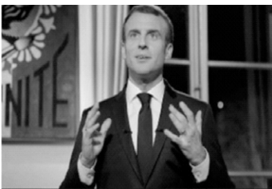
Emmanuel Macron, French President

The war between Russia and Ukraine can only be ended through negotiations, French President Emmanuel Macron has said.