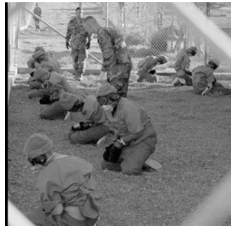
Hundreds of detainees have been incarcerated for years in the notorious American detention center in Cuba without any formal charges, and allegedly faced various forms of mental and physical torture

transfer—meaning they are not facing any charges or trial and will be transferred once countries willing to take them are found. Nine of the detainees are facing trials and only two of them are convicted. In a statement on Thursday, the US Defense Department claimed that the repatriation of the two Pakistanis was a part of attempts to reduce the “detainee population and ultimately [close] the Guantanamo Bay facility,” AP reported . President Joe Biden has promised to shut down the facility by 2024. Barack Obama had also promised that he would close Guantanamo Bay during his 2008 run for the US presidency.