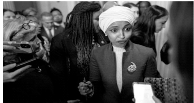
Ilhan Omar walks to her office after being ousted by the Republican-led House of Representatives to serve on the foreign affairs committee. Democrats say ousting from key committee is simply 'spite'

In the latest development in the saga over former presidents and vice-presidents and the improper retention of classified documents, the Wall Street Journal reports that FBI agents will soon search a property belonging to Mike Pence. Yesterday, FBI agents searched a home in Rehoboth Beach, Delaware, that belongs to President Joe Biden. No additional documents were found but Biden already faced the attentions of a special counsel, appointed to investigate his retention of documents from his time in the