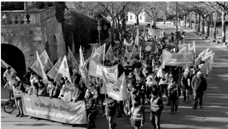
Mobilization in Fulda, Hesse, on February 9, 2023. Trade unions have demanded a 10.5 % increase in wages in the public sector to cope with the soaring inflation

Public service workers from all sectors, including health care, day-care, city administration, public transport, water distribution, universities, and municipal waste management, have gone on a warning strike protesting low wages and poor working conditions. The protest took place in the States of Berlin, North Rhine Westphalia (NRW), and Hesse, among others,