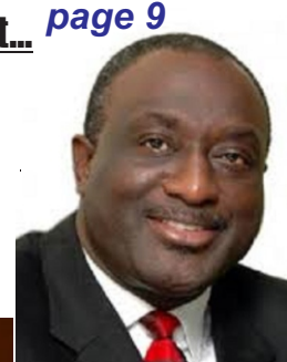
Hon Alan Kyerematen