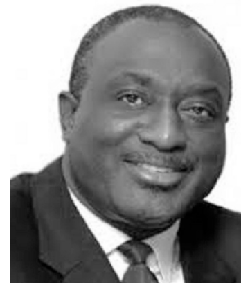
Hon Alan Kyerematen

The fact is we are in this economic doldrum now because of a fundamental failure of our fiscal policy since 2020. Since 2017 Ghana has posted record figures in most of the