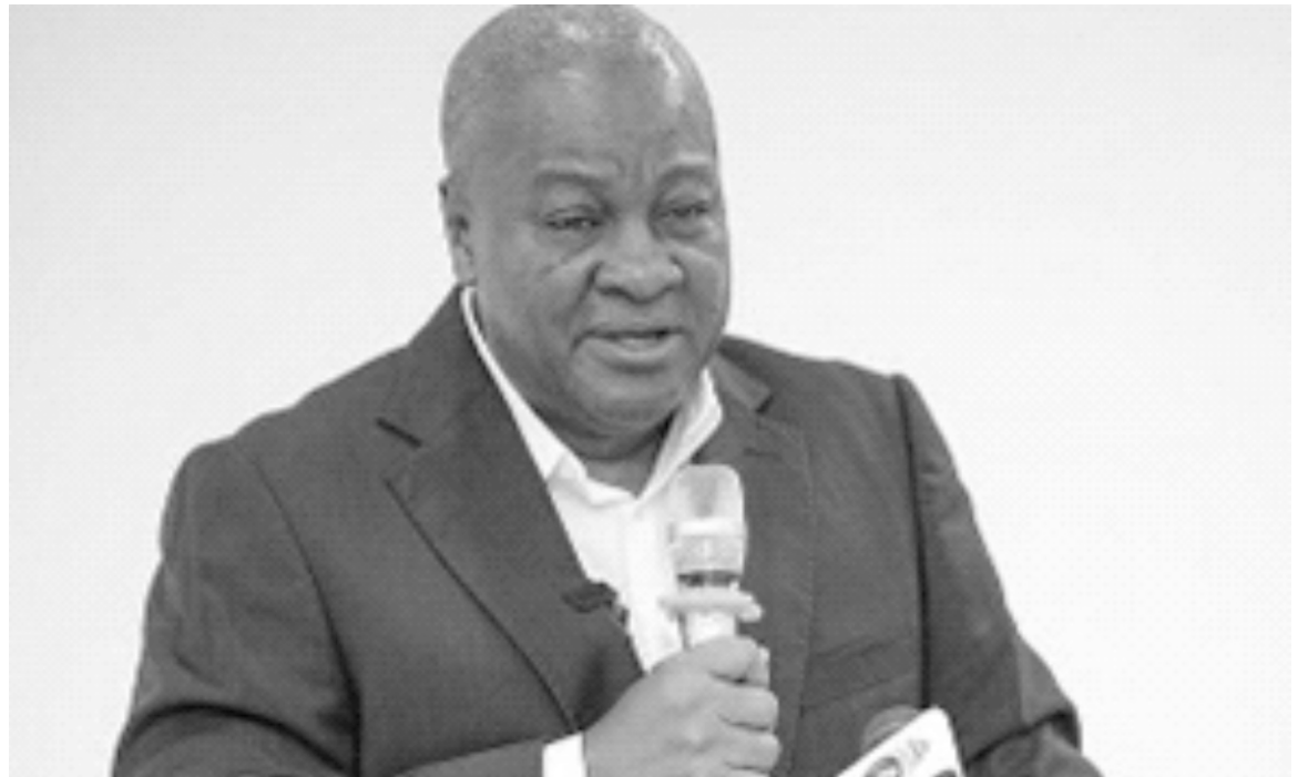
Former President of Ghana, John Dramani Mahama

John Dramani Mahama said, "I realised some of the things that we did, we made mistakes, we imported tractors and agricultural equipment, and we gave it to farmers. The farmer does not need the tractor, he does not need the agricultural equipment, he needs the services of a tractor," "So somebody who knows how to maintain that tractor must have a service centre, where he provides the services to the farmer. But we gave the tractors to the farmers, and in a year or two the tractor had broken down because he [farmer] doesn't know that every six months you must change the engine oil, you must change the filters, you must grease the