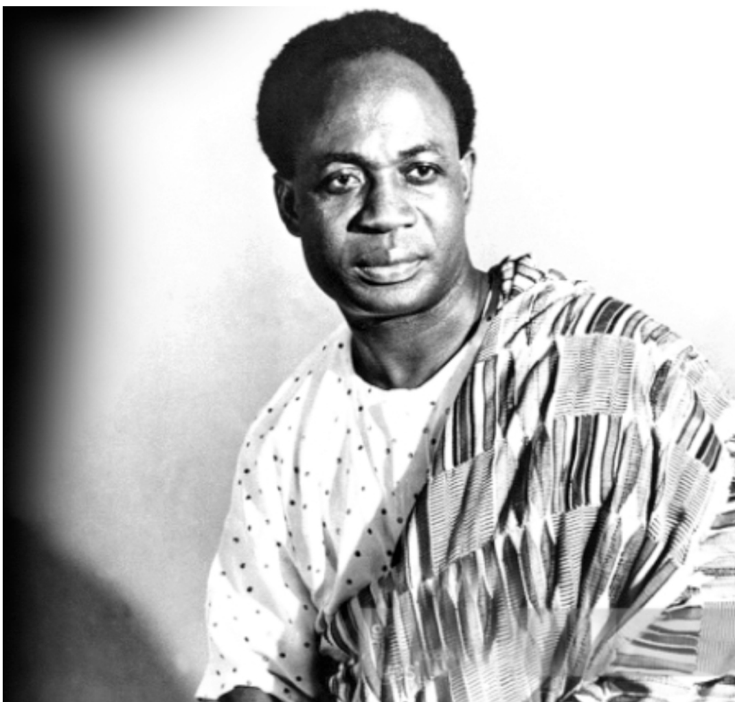
OSAGYEFO DR KWAME NKUMAH

T he Socialist Movement of Ghana (SMG) will on Friday 24 th February 2023 organise a public forum to observe the 57 th anniversary of the shameful overthrow of Ghana's first president and founder, Osagyefo Dr. Kwame Nkrumah. The Socialist Movement of Ghana has for over two decades now been organizing public forums and symposiums every 24 th February of every year to mark the day which has been widely described as "Ghana's Day of Shame" as it marked the country's darkest moments in history by way of reversing the enviable and progressive socio-economic, industrial and infrastructural achievements of the Convention People's Party (CPP) government led by Osagyefo Dr. Kwame Nkrumah.