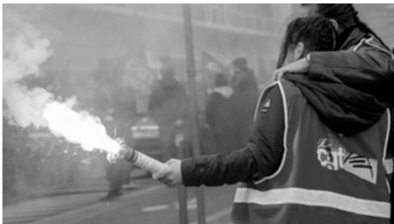
France's controversial pension reform bill will likely undergo crucial debates and voting in the National Assembly, the lower house of the French Parliament

French workers have intensified their protests against the unpopular pension reforms being pushed by Emmanuel Macron's government. Responding to a joint call issued by major French trade unions, on Thursday, February 16, for the fifth time since January this