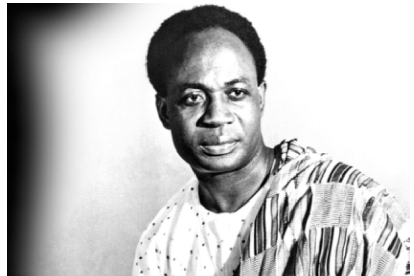
OSAGYEFO DR KWAME NKUMAH

The attack was designed by the Intelligence services of