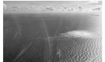
Seymour Hersh reported that divers from the US Navy's Diving and Salvage Center planted the explosives that were later detonated remotely on September 26, 2022. Earlier investigations by Denmark and Sweden had already confirmed sabotage