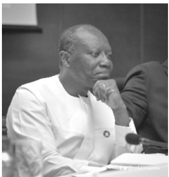
Finance Minister Ken Ofori-Atta

The Minister for Finance, Ken Ofori-Atta has disclosed that the presence of pensioner bondholders at the premises of his ministry over a two-week period caused him a great deal of distress. Addressing parliament on Thursday, February 16, 2023, the minister reiterated that government will honour the terms of bonds held by pensioners as it remains committed to the wellbeing and dignity of senior citizens.