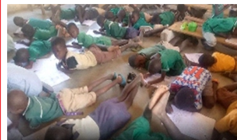
Some of the pupils taking an exam on the bare floor

...As Pupils Of Kpandema Primary School Lie On Bare Floor To Study, Write Exams