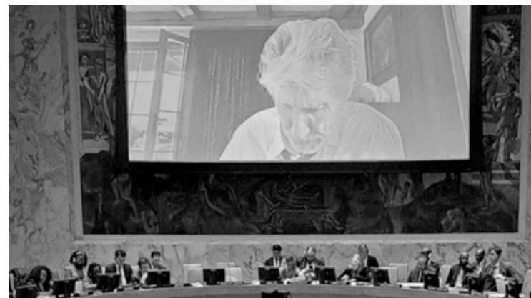
Roger Waters was invited to speak at the UNSC by Russia and called for a ceasefire but was criticized by Ukraine and the US. He has been critical of the West's supply of weapons to Ukraine, which he claims may prolong the war

During his address to the European Parliament, Zelensky thanked the