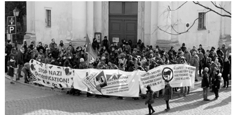
Anti-fascist Protest in Budapest on February 11, 2023. (Photo: via Vajnai Attila). Progressives slammed the Hungarian government as well as the police authorities, accusing them of covertly supporting neo-Nazi events that glorify Nazi war criminals and their collaborators

leadership of the Workers' Party of Hungary (2006), slammed the police authorities, the Ministry of Interior Affairs, and the conservative Fidesz party-led Hungarian government headed by Viktor Orban for covertly supporting neo-Nazi demonstrations that glorify Nazi criminals and their collaborators in Hungary during World War II. Neo-Nazi groups in Hungary started organizing Honor Day in 1997 to commemorate the Nazi soldiers and collaborators who were killed by the Soviet Red Army during the Siege of Budapest. As part of the annual commemoration, neo-Nazis from all over Eastern Europe gather in Budapest and march through Kapisztrán