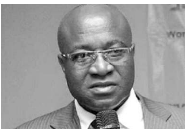
Osei Kyei-Mensah-Bonsu, Majority Leader of Parliament

The Majority Leader of Parliament, Osei Kyei-Mensah has stated that the legislature had little to no details about the government's Debt Exchange programme prior to its implementation.