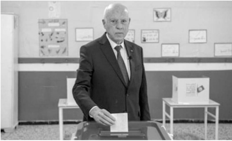
Tunisian president, Kais Saied

T housands of protesters in central Tunis over the weekend marched against the seizure of near total power by the Tunisian president, Kais Saied, demanding he steps down as they marked the anniversary of a key date in the 2011 revolution that brought democracy.