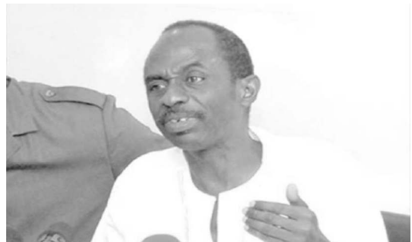
Johnson Asiedu Nketiah, National Chairman of the NDC

He said his outfit allows competition in