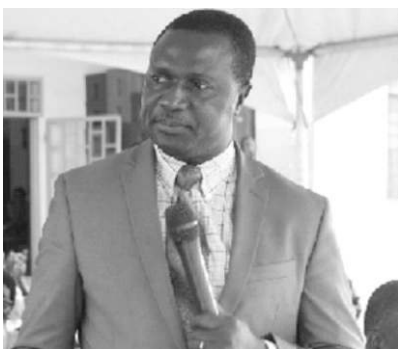
Minister of Education, Dr. Yaw Osei Adutwum

Government is yet to release feeding grant to Senior High Schools (SHS) across the country almost a week after school reopened. Information available to GHOne News indicates some schools have not yet started serving food at their various dining halls due to the situation. A teacher who spoke with GHOne on condition of anonymity said: "Students haven't been served at dining since we resumed, we are told the government is now distributing food items to the various Senior High Schools. "Parents should send more money to their wards for feeding," the teacher added. A student who reported on Monday also said: "I reported on Monday 9th January 2023