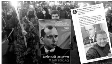
A collage of a photo of a right-wing rally in honor of Stepan Bandera and the tweet from the Ukrainian parliament on January 1, 2023. Since 2014, the post-Maidan regime in Ukraine and its far-right, hyper-nationalist legacy of World War II

Ukraine's support for neo-Nazi groups and its attempts to officially recognize pro-Nazi legions and Nazi collaborators from World War II have been steadfastly criticized by communists and other anti-fascist groups in the region. Even though Kiev's supporters in Europe and North America have hitherto maintained a complicit silence about these maneuvers, the latest gesture by the Ukrainian parliament, cheering on the birthday of the Nazi collaborator Stepan Bandera, has drawn sharp criticism even from neighboring Poland, its staunch ally in the ongoing war with Russia.