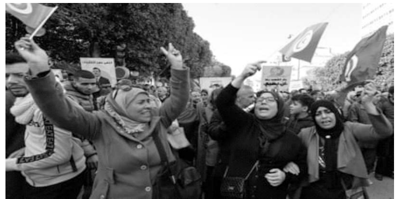
Protests on 14 January come 12 years to the day of the 2011 uprising.

While there has been no major crackdown on opponents of Saied, and police have allowed most protests against him, their handling of demonstrations on 14 January last year was more forceful, prompting condemnation from rights activists.