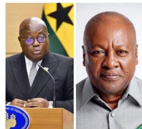
President Nana Akufo-Addo (left) and former President John Mahama

F ormer President John Dramani Mahama has taken a swipe at President Nana Akufo-Addo over what he says is his penchant for clearing his appointees and members of his government accused of wrongdoing.