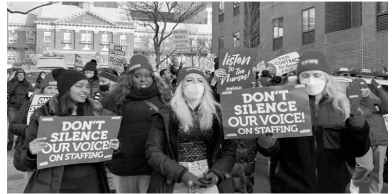
NYSNA nurses on the picket line outside of Montefiore Medical Center, in the Bronx. Nurses, organized by the New York State Nurses Association (NYSNA) are demanding safe patient-to-staff ratios, fair wages, and to maintain existing healthcare benefits

These nurses are referring to one of the primary concerns of unionized nurses: the lack of safe staff-to-patient ratios at