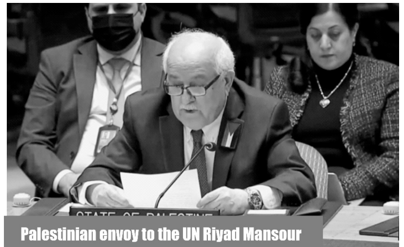
Palestinian envoy to the UN Riyad Mansour

Palestinians have criticized Israel's repeated practice of withholding or deducting from Palestinian funds, particularly at a time when the occupied territories are facing an unprecedented economic crisis, and have called this move " piracy ." According to the United Nations Conference on Trade and Development (UNCTAD), Israel, as an occupying power, controls close to two-thirds of all Palestinian revenue generated through taxation, customs fees, and other sources. As per the agreements reached during the Oslo accords in the 1990s and afterwards, Israel is supposed to transfer the revenue it collects from Palestine to the PA so that the latter is able to fulfill its administrative and political responsibilities. However, as the UNCTAD report claims , Israel has a habit of making "unilateral deductions," which makes the finances of the PA