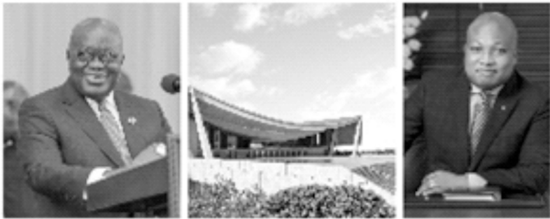
The National Cathedral (centre) is expected to cost $350m. President Nana Akufo-Addo (left) and Samuel Okudzeto Ablakwa

For a country that has Christians making up over 70% of the population and its Muslim community being led by a man whose occasional visits to Christian denominations have been well documented as a show of religious tolerance and unity; erecting a facility to serve as a hub of activities for Christendom should under normal circumstance create no fuss and be well-embraced by most if not all of the country's population. That is not the case for Ghana's National Cathedral which is being built by the Nana Addo Dankwa Akufo-Addo government. Instead of it being welcomed with open arms, it has sharply divided opinions which perhaps reflect the deep-seated partisanship that