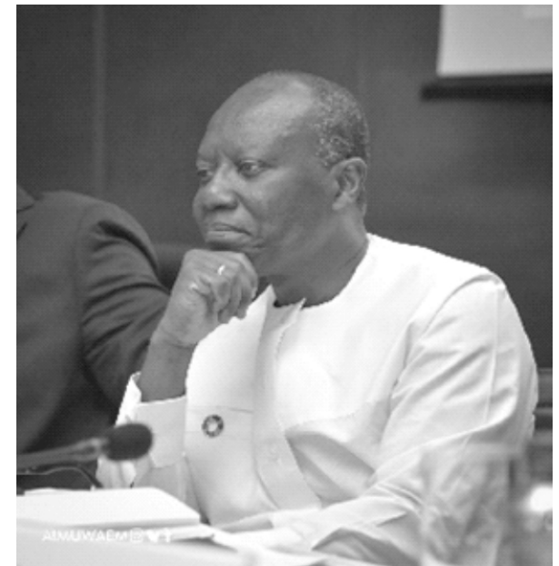
Ken Ofori-Atta, Minister of Finance

“Out of GH¢21,844,189,185.24 mobilised, GH¢11,750,683,059.11 was spent on COVID-19 activities and the rest on budget support. On COVID-19 activities, we noted that GH¢8,658,496,124.96 was spent in 2020, GH¢3,084,311,725.45 in 2021 and GH¢7,875,208.70 in 2022 to