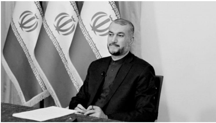
Iranian Foreign Minister Hossein Amir-Abdollahian. Last week, the European parliament adopted a resolution asking member countries to designate the IRGC a terrorist organization over its alleged "terrorist activities, suppression of protests, and supplying of drones to Russia"

Iranian Foreign Minister Hossein Amir-Abdollahian over the weekend warned that Iran may leave the Nuclear non-Proliferation Treaty (NPT) if the European parliament's resolution asking member countries to designate the Islamic Revolutionary Guard Corps (IRGC) a terrorist organization is implemented, Press TV reported . He was speaking on the sidelines of the special session