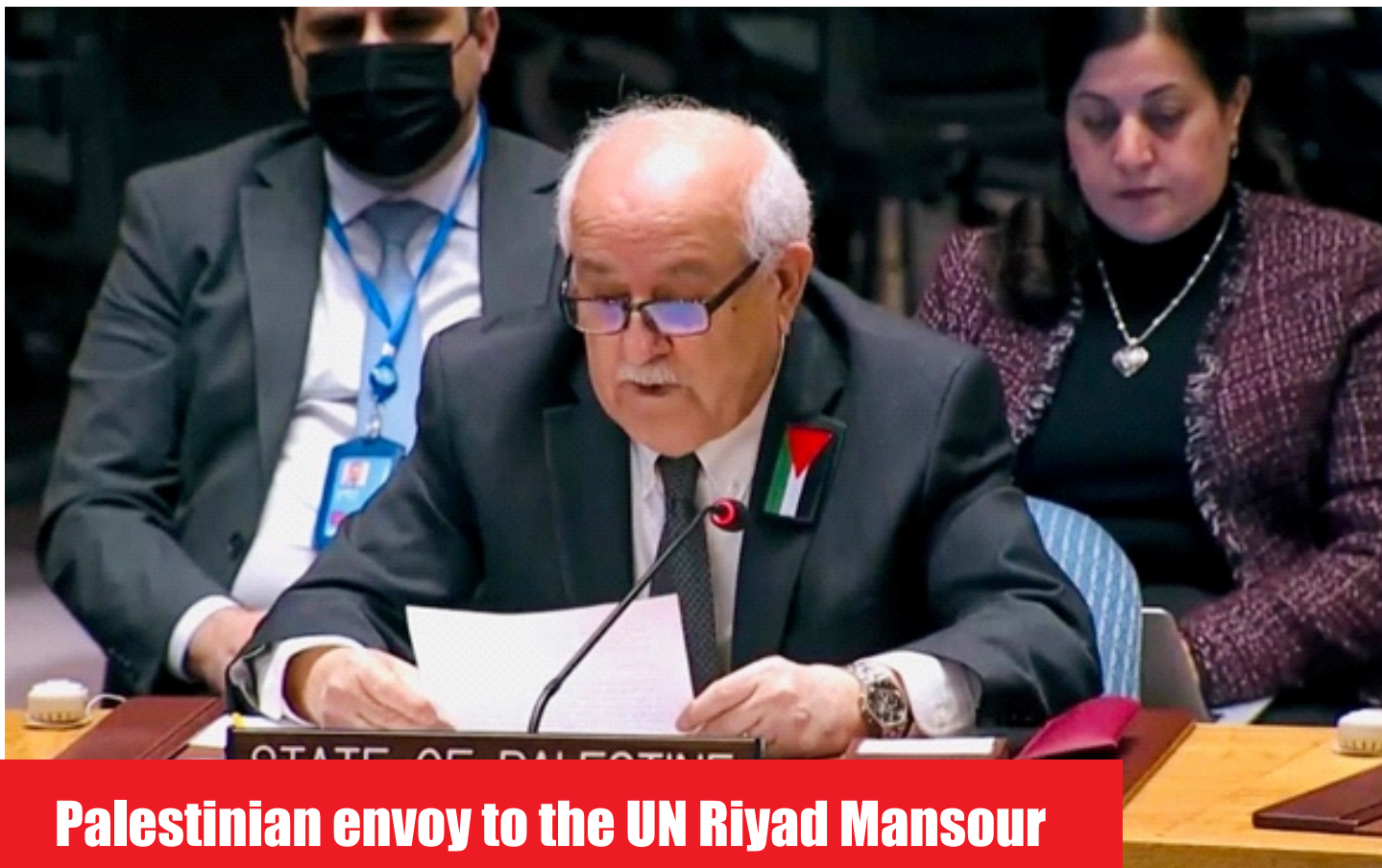
Palestinian envoy to the UN Riyad Mansour