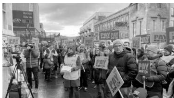
National strike by teachers in Scotland on November 24, 2022. School teachers and their unions in Scotland launched the 'Pay Attention' campaign last year demanding a 10% hike in wages to meet the soaring inflation

School teachers across Scotland are set to intensify their fight for higher wages at par with inflation. Teachers of primary and special schools affiliated to the Educational Institute of Scotland (EIS) union will go on strike on January 10. Secondary teachers affiliated to EIS, NASUWT, and Scottish