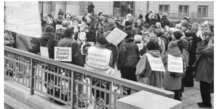
Protest in Stockholm against the new law on espionage. The new espionage law that came into effect on January 1 penalizes investigative journalism and whistle-blowing that may damage Sweden's relationship with another state or an international organization such as NATO, European Union, or United Nations

In November last year, the Communist Party in Sweden had stated that “the restrictions on freedom of expression and freedom of the press do not come in a vacuum, they are closely linked to Sweden's rapprochement with NATO. It is also NATO cooperation and upcoming NATO wars in which Sweden participates that should not