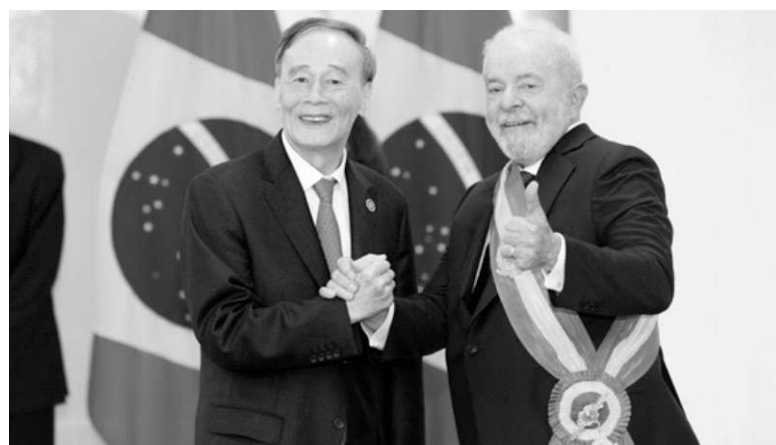
Brazilian President Lula da Silva with Chinese Vice-President Wang Qishan after his swearing-in. Being an acolyte of the US-led "rules-based order," India faces the specter of isolation as Lula takes over as Brazil's president and the center of gravity in BRICS is poised to shift to the left of center

Enter Brazil. The victory of Bolsonaro in 2018 would also have been a moment of risk for the BRICS, as the new elites in power in Brasilia made no secret of their desire to place their main stake on rapprochement with the US. Surely, India saw in Bolsonaro a "natural ally" within the BRICS, which largely explains the high honor Modi bestowed