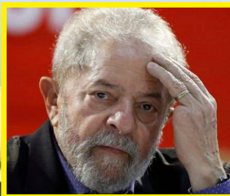
Luis Inacio Lula da Silva, President of Brazil