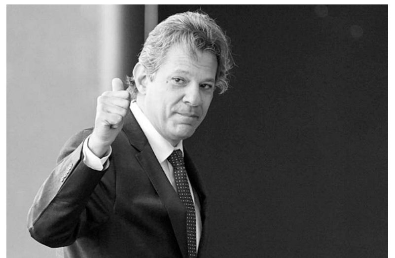
Brazil's Finance Minister Fernando Haddad flew to Switzerland to talk to world leaders about the economic perspectives of the new government. The ministers represented the new government at the event with the world's economic leaders in Switzerland

Haddad also said that the government will have a permanent policy to value the minimum wage and measures to tackle the indebtedness of the poorest families.