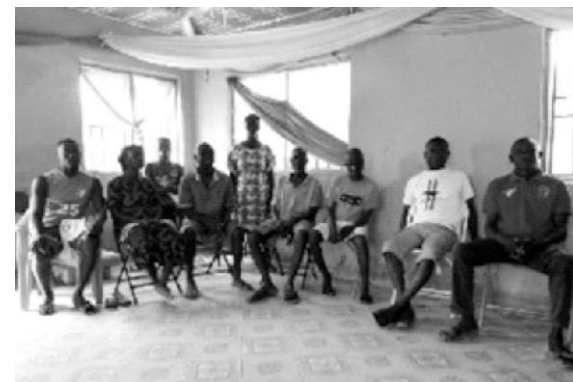
A section of the aggrieved farmers

He questioned the motive behind the recent deployment of about 17 armed