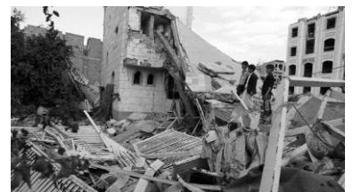
According to the report of Eye for Humanity, in the last seven years of the Yemen war, bombings carried out by the Saudi-led coalition have killed 17,734 people and injured close to 30,000. According to its data, at least 4,017

weapons. However, the blockade prevents the inflow of essential supplies including food and medicines to Yemen, which is heavily dependent on imports. The blockade was partially relaxed during the six-month-long ceasefire. However, the Houthis had demanded its complete lifting as the basis for extending the ceasefire, which the Saudis rejected. According to UNICEF, as a result of almost eight years of war, the child mortality rate in Yemen has become the highest in the Arab world with over 60 deaths per 1,000 births. According to it, the figure of newborn babies dying every day in Yemen is almost double what the government claims. UNICEF has reported that nearly 52,000 new born babies are dying each year in Yemen, an average of at least 142 per day.