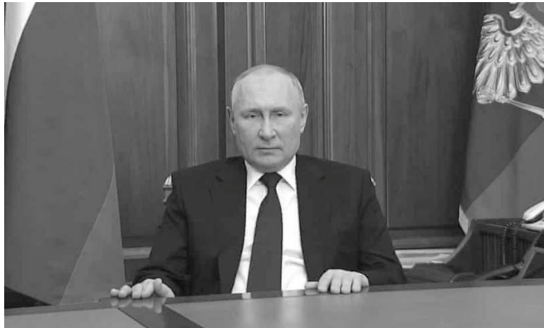
Vladimir Putin, Russian President

"In terms of achieving the end result and the victory that is inevitable, there are several