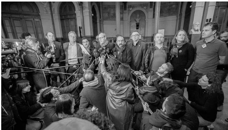
French trade union leaders addressing media outside the Paris Labor Exchange. The Macron-led government is making a new bid to push controversial pension reforms, calling to increase the retirement age from 62 to 64

All the major trade unions in France last week gave a joint call for protests against the proposals for pension reforms announced by the Emmanuel Macron-led government. The unions, including the General Confederation of Labor (CGT), the French Democratic Confederation of Labor (CFDT), Workers' Force (FO), the French Confederation of Christian Workers (CFTC), the French Confederation of