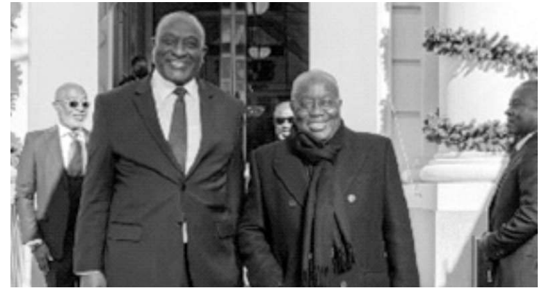
Alan Kyerematen, Minister for Trade and Industry and President Akufo-Addo

The longest-serving Trade and Industry Minister in Ghana, urged African leaders and the United States to identify key areas whose transformation will be felt by the average African amidst the global economic meltdown. Alan Kyerematen also joined President Nana Akufo-Addo to attend a series of high-profile meetings and events including the meetings with the Managing