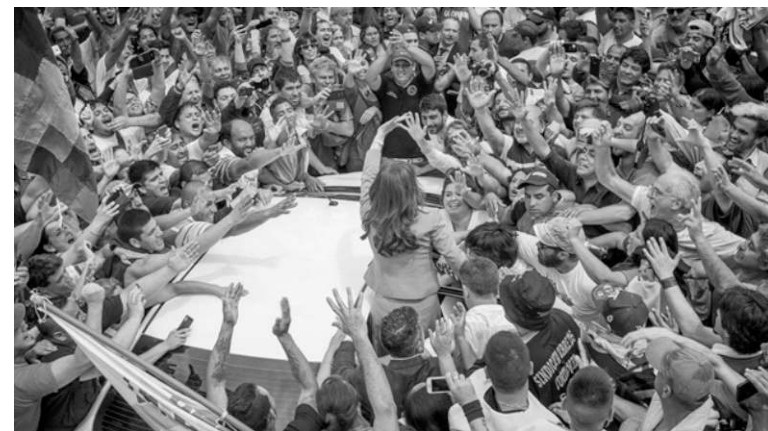
Cristina Fernández de Kirchner surrounded by supporters on the streets of Buenos Aires. The lawfare against Argentina's most prominent and loved Peronist leader and one of the towering figures of Latin America's political left has evoked widespread condemnation in the country as well as across the region

On Monday, December 5, Argentina's president, Alberto Fernández, in a nationally televised speech, announced that he would open an investigation into the meeting to look into the purpose of the trip, the participants and its financing. According to reports from local media, many of those involved are alleged to have conspired in launching nefarious, politically motivated, judicial, political and media campaigns against the ruling government of left-wing Frente de Todos coalition to destabilize it and create a political crisis in the country.