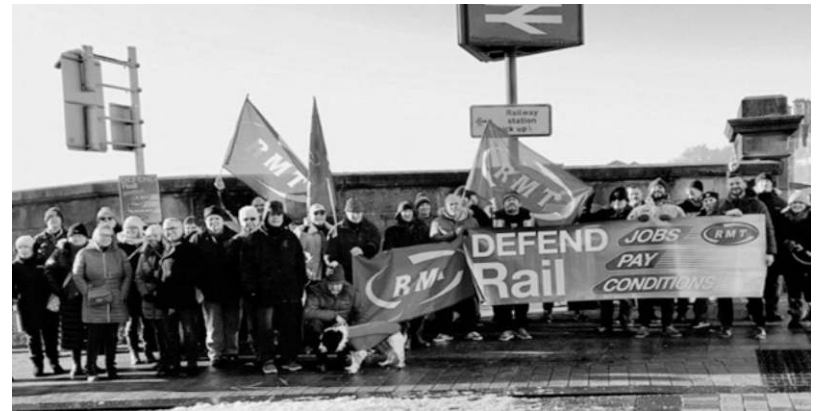
Rail workers picket outside the Preston Station. The National Union of Rail, Maritime, and Transport Workers (RMT) has been at the forefront of the protests against the austerity-driven policies of the Tory government in the UK and the fight against the ongoing cost of living crisis

government wants "to make effective strike action illegal in Britain." The government passed a controversial piece of legislation, the Conduct of Employment Agencies and Employment Businesses (Amendment) Regulations 2022, in July this year. Workers had termed the legislation "the Scab's Charter" as it calls for workers who take industrial action to be penalized and allows for the hiring of temporary agency workers to replace strikers. Unions including the RMT have been at the forefront of the struggle against the ongoing cost of living crisis in the country. Costs of essentials such as fuel, energy, and food have been