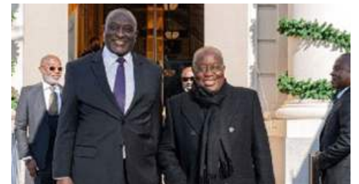
Alan Kyerematen, Minister for Trade and Industry and President Akufo-Addo

Ghana's Trade and Industry Minister, Alan John Kwadwo Kyerematen, has advocated for intensive investment in the agricultural sector as part of major plans to economically empower the African continent.