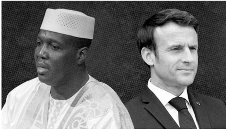
A new burst of anti-colonial feeling has swept through France's former colonies, where the debates are now centered around breaking with its stranglehold on their economies and ending the military intervention by its troops

On November 21, Mali's interim Prime Minister, Colonel Abdoulaye Maïga posted a statement on social media to say that Mali has decided "to ban, with immediate effect, all activities carried out by NGOs operating in Mali with funding or material or technical support from France." A few days before this statement, the French government cut official development assistance (ODA) to Mali because it believed that its government is "allied to Wagner's Russian mercenaries." Colonel Maïga responded by saying that these are "fanciful allegations" and a "subterfuge intended to deceive and manipulate national and international public opinion." Tensions between France and Mali have increased over the course of 2022. The former colonial power returned to Mali with a military intervention in 2013 to combat the rise of Islamist insurgency in the northern half of Mali; in May 2022, the military government of