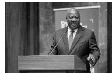
John Dramani Mahama

Former President John Dramani Mahama has appealed to Ghanaians to donate funds towards the organisation of the 10th National Delegates Conference of the National Democratic Congress (NDC). The conference, slated for Saturday, December 17, in Accra, is to elect national officers to steer the Party's affairs for the next four years.