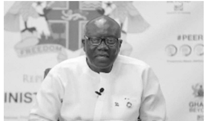
Minister of Finance Ken Ofori-Atta announced the debt operation on December 5

"Debt exchange for pension funds will mean that workers will not have access to Tier 3 funds after waiting for 5 – 15 years. This is simply unacceptable! To the National Pension Regulatory Authority's (NPRA) regulations, all Pension Schemes have