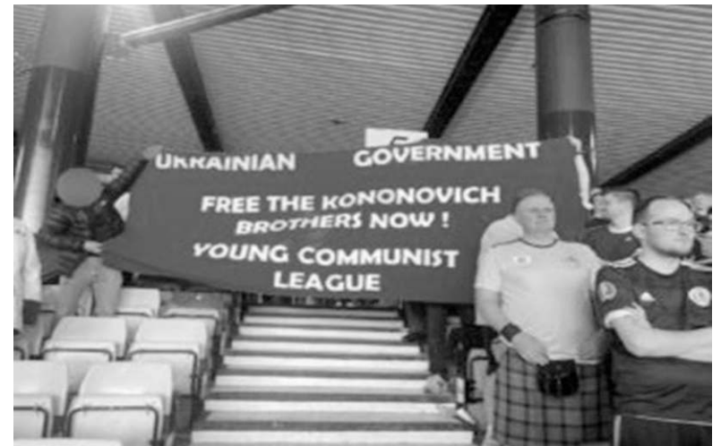
Hampden Park football stadium in Glasgow. (YCL-Glasgow)