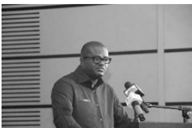
Sacked minister Charles Adu Boahen

New Patriotic Party Member of Parliament for Mpraeso Constituency, Davis Opoku Ansah, has called for the resignation of finance minister, Ken Ofori-Atta following the dismissal of the Minister of State for Finance, Charles Adu Boahen. President Nana Addo Akufo-Addo on Monday, November 14, 2022, sacked Mr Adu Boahen hours ahead of the premiere of an investigative piece by Anas Aremeyaw Anas. But reacting to the sacking in a Facebook post, the Mpraeso MP who had recently joined some majority MPs to demand the sacking of Ofori-Atta and Adu Boahen, said the minister for finance must as well resign.