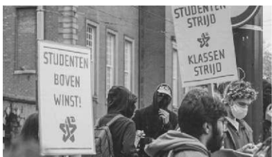
The protesters alleged that international students are brought to the Netherlands under false promises but then have to struggle to find housing and proper facilities after arrival

Students and youth groups in Amsterdam have demonstrated against the University of Amsterdam's (UvA) failure to provide enough facilities even as it seeks to admit more international students. The students said there was an acute shortage of facilities, staff and infrastructure. The protest was called by the General Student Association Amsterdam (ASVA). Activists from various youth