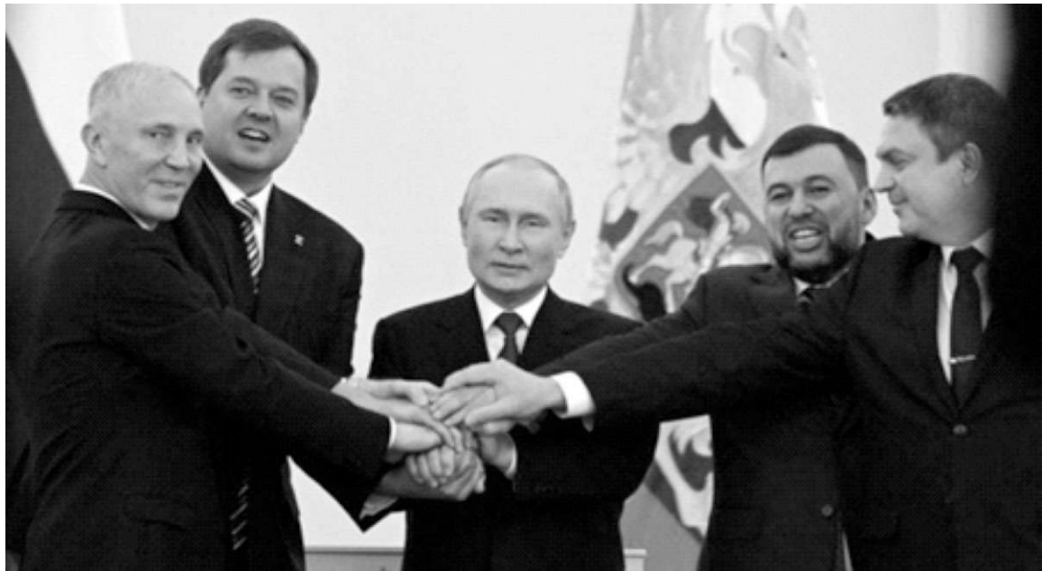
Russian President Vladimir Putin (C) with leaders of Donetsk, Luhansk, Kherson and Zaporizhzhia at the ceremony annexing the four regions as part of Russian Federation, Moscow, September 30, 2022. US President Joe Biden has spoken twice about “compromise” by Kiev, which is a major shift from the US stance that Russian forces should get out of Ukraine

Notably, Biden has spoken twice about “compromise” (read territorial concessions) by Kiev, which is a major shift from the US stance that the Russian forces should get out of Ukraine. Biden concluded: “That's – that's what's going to happen, whether or not. I don't know what they're going to do. And – but I do know one thing: We're not going to tell them what they have to do.” Taken together, Biden's remarks are consistent with the “scoop” by NBC News on Wednesday, citing informed sources, that during the National Security Advisor Jake Sullivan's unannounced visit to Kiev last week, he studied Ukraine's readiness for a diplomatic solution to the conflict. The NBC channel reported that Sullivan was exploring options for ending the conflict and the chance of starting negotiations and raised the need for a diplomatic settlement during meetings with Ukrainian authorities. It said some US and Western officials increasingly believe that neither Kiev nor Moscow can achieve all of their goals, and the winter slowdown in hostilities could provide a window of opportunity to start negotiations.