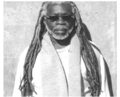
After over 36 years in prison, movement elder, political prisoner, and revolutionary health worker Mutulu Shakur has been granted parole with less than six months to live

he was convicted before 1987. This means that the decision to parole him rests with the antiquated US Parole Commission , which was meant to be phased out 20 years ago. The continued existence of the commission rests solely on the fact that there are around 200 prisoners still jailed under “old law”. Finally it was not the courts that granted Shakur's release. The federal parole commission caved under pressure from activists in October, paroling Shakur with far less than six months to live. “It's long overdue that this took place, and I think it speaks to the extreme vindictiveness of the legal authorities, judicial authorities and political authorities of the state of New York and the country more