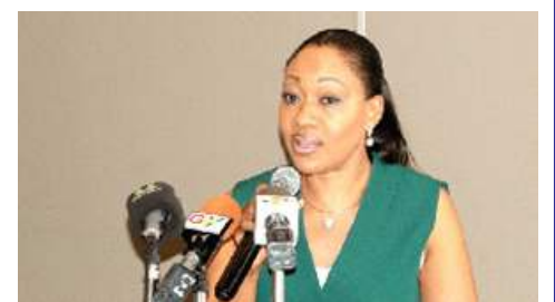
Jean Mensa, Chairperson of the EC

T he Electoral Commission of Ghana has cancelled the certificates of 17 political parties who it says have no regional and national presence and, therefore, are flouting the laws of Ghana.