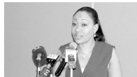
Jean Mensa, Chairperson of the EC

Democratic People's Party (DPP) United Front Party (UFP) United Development System Party (UDSP) Every Ghanaian Living Everywhere (EGLE) Yes People's Party (YPP) United Ghana Movement (UGM) Democratic Freedom Party (DFP) New Vision Party (NVP) Ghana