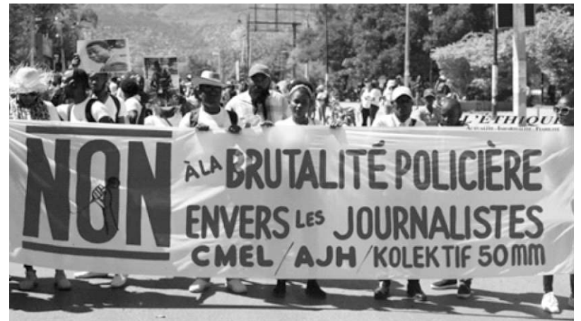
After an increase in murders, attacks and criminalization against journalists, they mobilized in the capital Port-au-Prince to demand guarantees for life