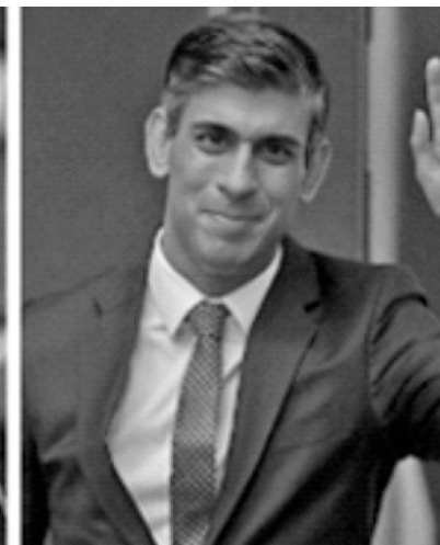
John Dramani Mahama and Rishi Sunak

Queen Elizabeth II in September, CNN reports. CNN understood that the King was traveling to London from the private royal estate of Sandringham