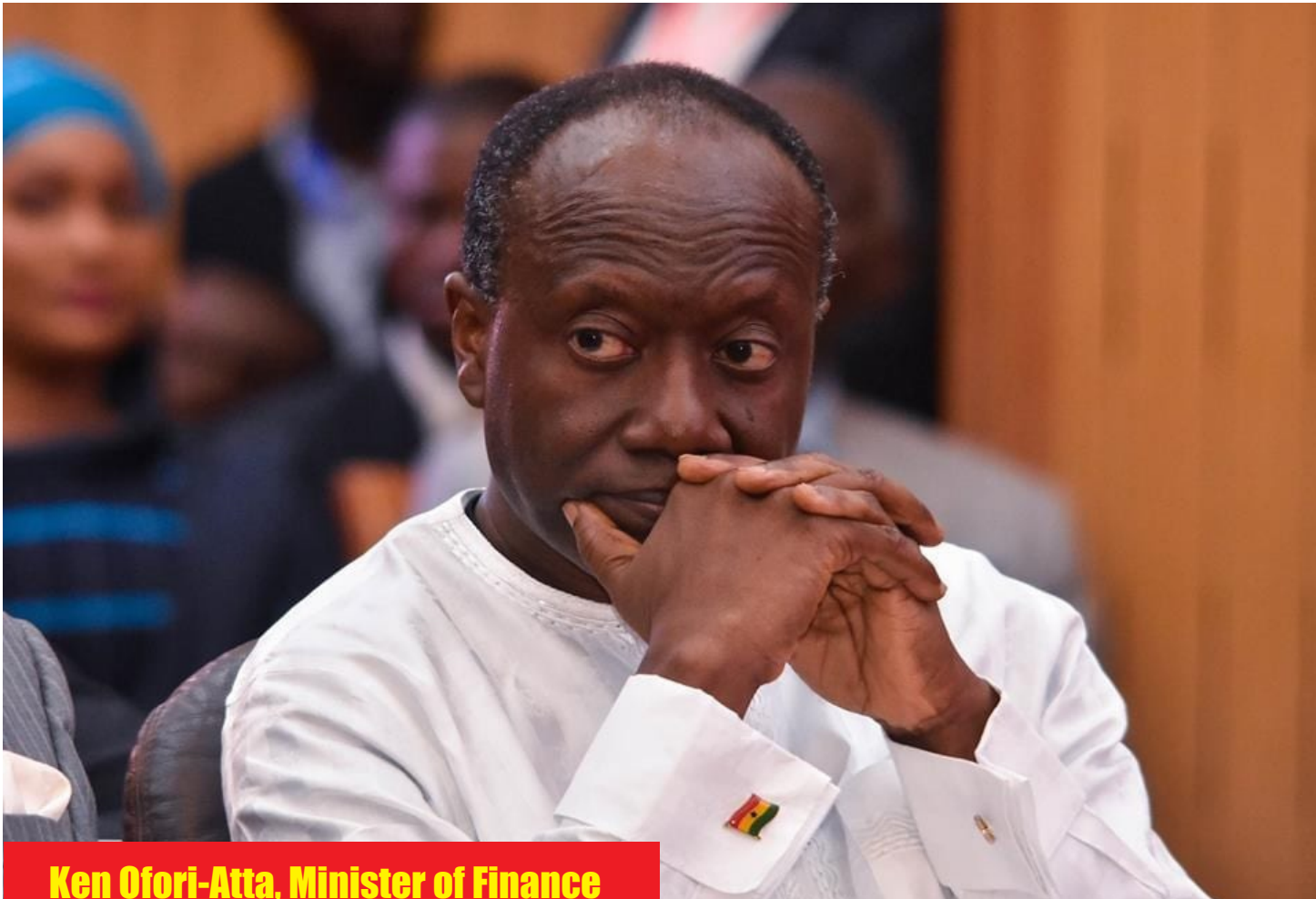
Ken Ofori-Atta, Minister of Finance

Majority, Minority MPs Call For His Dismissal As Finance Minister