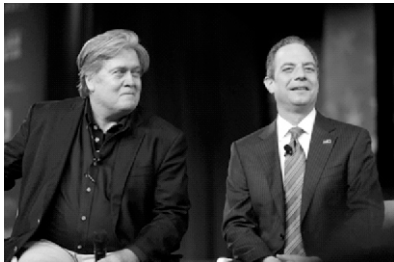
Former Chief White House Strategist Steve Bannon and Former Chief of Staff Reince Priebus speaking at the 2017 Conservative Political Action Conference (CPAC) in National Harbor, Maryland. Despite receiving a prison sentence for defying a subpoena to testify and provide evidence for the January 6 investigations, Bannon could remain free for a year or more

S teve Bannon, former chief strategist for Donald Trump, was last Friday sentenced to four months in prison and a $6,500 fine. He was convicted of defying a subpoena from lawmakers requesting evidence and testimony in the investigations following the January 6, 2021 attacks on the US Capitol.