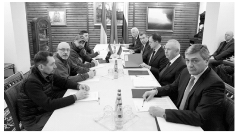
Russian and Ukrainian delegations at the negotiating table on March 7, 2022. Ukrainians have been paying a terrible price for the failure of ensuring sensible and reasonable negotiations from 2014 to February 2022 – which could have prevented the invasion by Russia in the first place, and once the war started, could have led to the end of this war

It was clear to Macron by 2020 that the point of the negotiations was about more than just Minsk and Ukraine; it was about the creation of a “new security architecture” that did not isolate Russia – and was also not subservient to Washington. Macron developed these points in February 2021 in two directions and spoke about them during his interview with the Atlantic Council (a US think tank). First, he said that NATO has “pushed our borders as far as possible to the eastern side,” but NATO’s expansion has “not succeeded in reducing the conflicts and threats there.” NATO’s eastward expansion, he made clear, was not going to increase Europe’s security. Second, Macron said that the US unilateral withdrawal from the Intermediate-Range Nuclear Forces Treaty in 2019 – and Russia’s mirroring that – leaves Europe unprotected “against these Russian missiles.” He further said, “As a European, I want to open a discussion between the European Union and Russia.” Such a discussion would pioneer a post-Cold War understanding of security, which would leave the United States out of the conversation with Russia. None of these proposals from Macron could advance, not only because of hesitancy in Russia but also principally because they