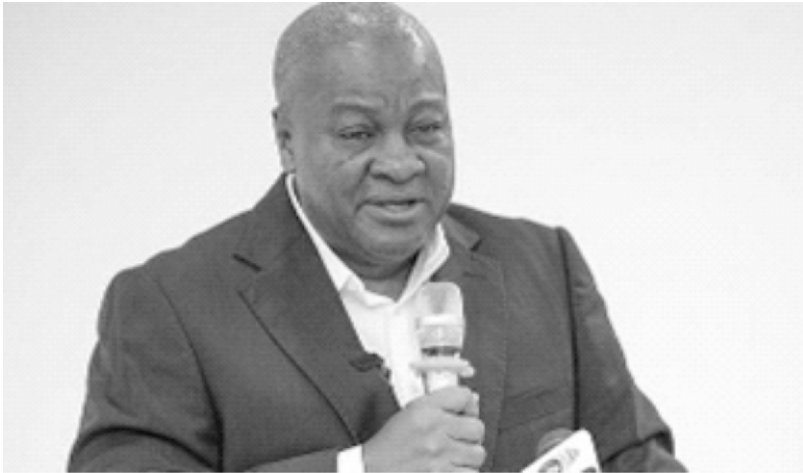
Former President John Dramani Mahama