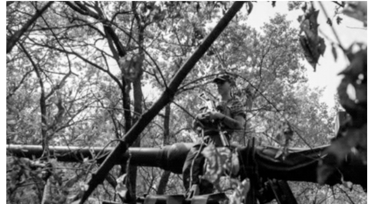
By the sixth day of the Ukrainian counter-offensive, the echo chamber in the West has fallen silent. There are no tall claims. Zelensky must be a worried man as he needs to convince the US that such massive multi-billion dollar military aid has been justified

The solitary Ukrainian breakthrough remaining as of Saturday night was a bridgehead across the Ingulets river — the so-called Andreevsky bridgehead. There is speculation that Russians may have lured the Ukrainian troops into a “fire trap.” The river crossings have been cut off and Russians are probably encircling the Ukrainian troops trapped on the western side of Ingulets with no supplies or reinforcements reaching them. The counteroffensive has lost its bite and is now turning into positional battles on one or two sites in the Mykolaiv-