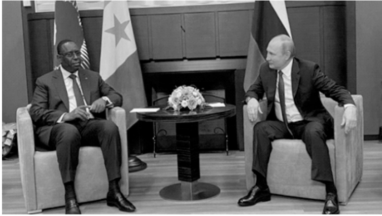
Russian President Vladimir Putin with the President of Senegal and leader of the African Union Macky Sall in Sochi. "Anti-Russia sanctions have made this situation worse and now we do not have access to grain from Russia, especially wheat," said AU chairperson Macky Sall following a meeting with Vladimir Putin on June 3

U S-led sanctions on Russia in the wake of its "special military operation" in Ukraine have caused severe food shortages in Africa, noted the leadership of the African Union (AU) in a meeting with Russian President Vladimir Putin on June 3 in the Russian city of Sochi along the Black Sea. A week before the military operation was launched by Russia on February 24, with the stated aim of "demilitarization and denazification" of Ukraine, global prices of wheat, which is a staple for 2.5 billion people across the world, had already soared by 55%. This was in no small part in anticipation of the conflict between the two countries which together