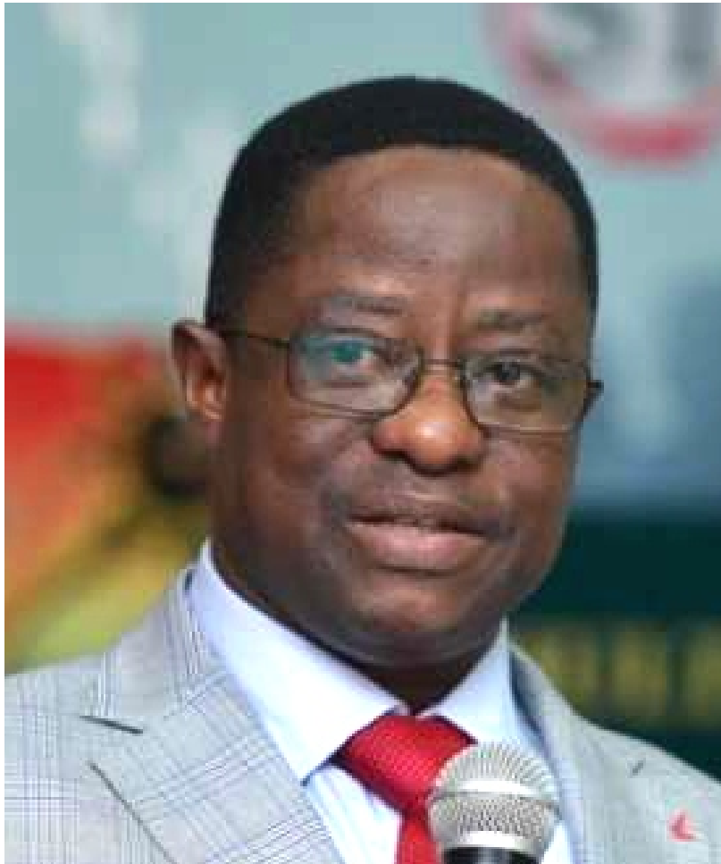
John Peter Amewu, Minister Of Railways Development

Minority Calls For Prosecution Of GIIF Board, Management Over $2 M Deal