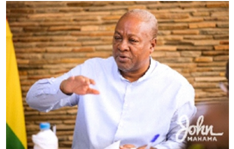
President John Dramani Mahama

Mahama Congratulates Kenya's President-Elect William Ruto Over Election Victory