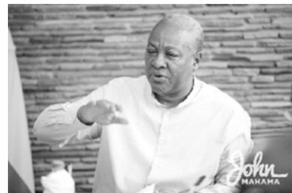
President John Dramani Mahama

Congratulations Dr. William Samoei Ruto on your election as President of Kenya.