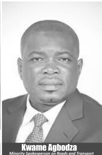
Kwame Agbodza Minority Spokesperson on Roads and Transport

about is the one that is going to run on columns in the sky like the ones you see in Dubai but no agreement has been signed. "It is not possible to be done now. I don't see any sky train being done in the next 3-4 years. There is not going to be any Sky train in the country. It is not possible," he stated. The Minister noted that the funding for the construction of some already commenced projects is becoming a problem for government hence the need for the state to forgo the sky train project. "Rail construction takes a lot of time and it is also capital intensive. A kilometer of a railway line is about four to five times the cost of building a concrete infrastructure in terms of building an asphaltic road. "So considering the fiscal space that we have in the country, facilities to absorb it is becoming problematic for the government and you know our current debt to GDP which is in excess of 70%," he said. The Accra SkyTrain Project envisaged a total track length of 194 kilometers across all routes and was projected to provide transportation to around 380,000 people each day. President Nana Akufo-Addo