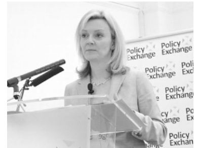
Hardline conservative Liz Truss emerged victorious over Rishi Sunak to replace Boris Johnson as leader of the Conservative Party

Domestically, her plans skew close to Tory cultural orthodoxy. She has said she will somehow "stand up for free speech" and at the same time stressed the " need to fight back against the identity politics that has infected [UK] institutions " and the need to reject "woke" civil service culture . She has suggested, as is almost a tradition in Britain, that she will move to exclude trans women from women's spaces, and attempt to make it harder for those