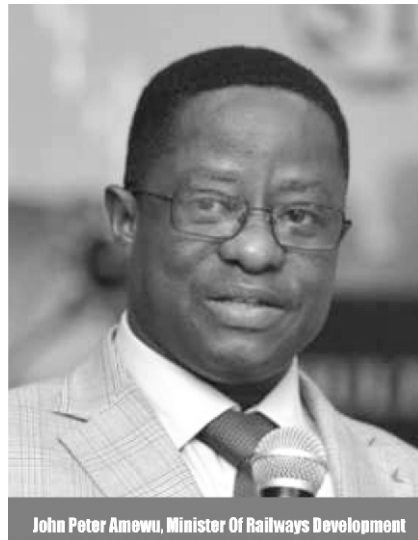
John Peter Amewu, Minister Of Railways Development

about is the one that is going to run on columns in the sky like the ones you see in Dubai but no agreement has been signed. "It is not possible to be done now. I don't see any sky train being done in the next 3-4 years. There is not going to be any Sky train in the country. It is not possible," he stated. The Minister noted that the funding for the construction of some already commenced projects is becoming a problem for government hence the need for the state to forgo the sky train project. "Rail construction takes a lot of time and it is also capital intensive. A kilometer of a railway line is about four to five times the cost of building a concrete infrastructure in terms of building an asphaltic road. "So considering the fiscal space that we have in the country, facilities to absorb it is becoming problematic for the government and you know our current debt to GDP which is in excess of 70%," he said. The Accra SkyTrain Project envisaged a total track length of 194 kilometers across all routes and was projected to provide transportation to around 380,000 people each day. President Nana Akufo-Addo