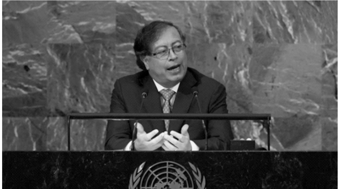
Gustavo Petro addressed the UN General Assembly on September 20, 2022. In his speech to the UN General Assembly, the Colombian president highlighted the necessity of ending the war on drugs and saving the environment

The jungle that tries to save us, is at the same time, destroyed. To destroy the coca plant, they spray poisons, glyphosate in mass that runs through the waters, they arrest its growers and imprison them. For destroying or possessing the coca leaf, one million Latin Americans are killed and two million Afro-Americans are imprisoned in North America. Destroy the plant that kills, they shout from the North, but the plant is but one more of the millions that perish when they unleash the fire on the jungle. Destroying the jungle, the Amazon, has become the slogan followed by States and businessmen. The cry of scientists baptizing the rainforest as one of the great climatic