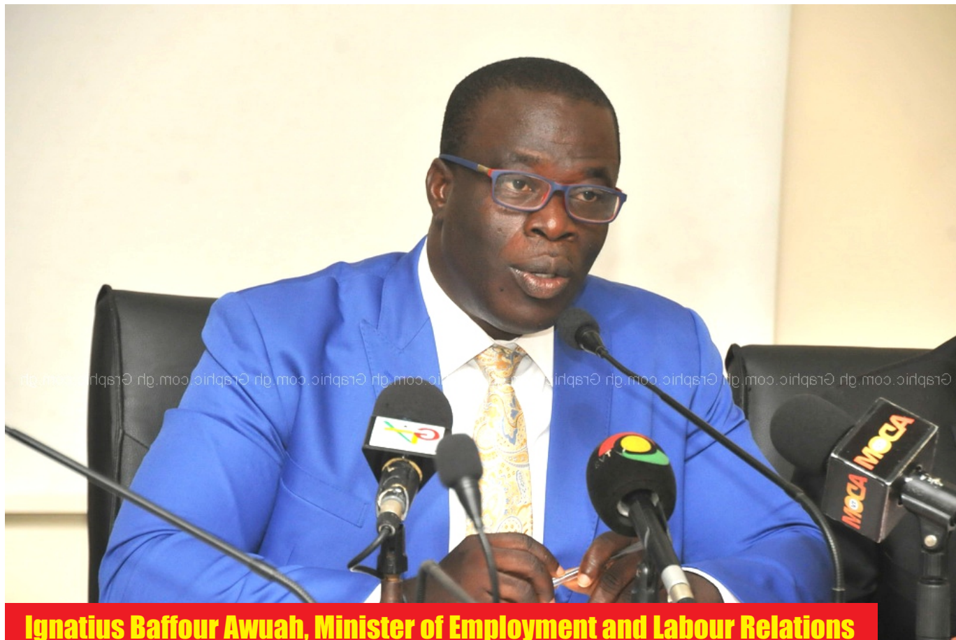
Ignatius Baffour Awuah, Minister of Employment and Labour Relations