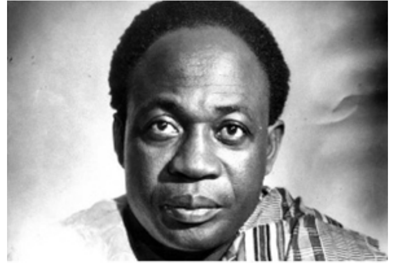
Dr. Kwame Nkrumah

The Diaspora African Forum has petitioned the United States of America (USA) government to arrest and prosecute all four police officers who were caught on video manhandling George Floyd at Minneapolis, USA, resulting in his death. The Forum further called on the USA government to seek a drastic change in systemic policies that oppresses and suppresses African-Americans and violates their human rights. The petition, signed by