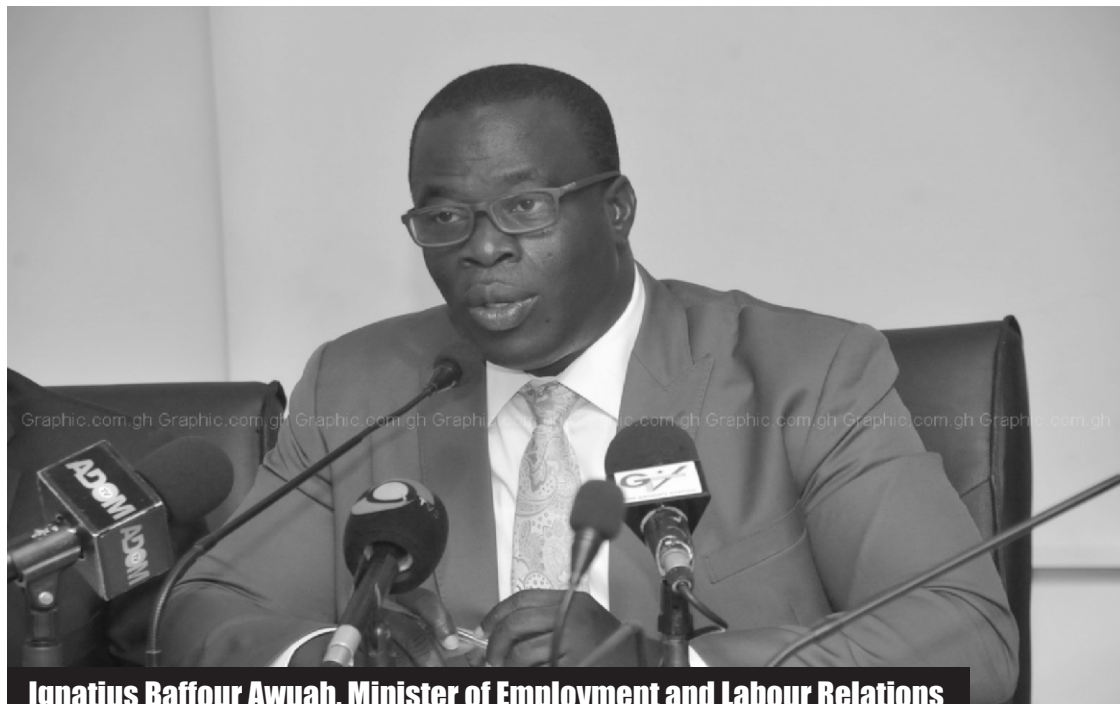
Ignatius Baffour Awuah, Minister of Employment and Labour Relations

since the price of commodities will not reduce.