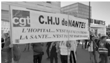
French health workers mobilize in front of the University Hospital Center of Nantes. Health workers and those in associated sectors held a national day of action demanding pay hikes, more staff, improved and safe working conditions, job security, and sufficient funds and resources for hospitals