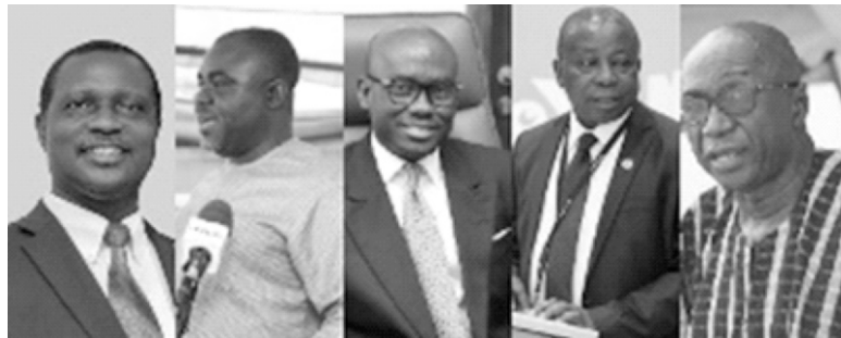
Ministers whose ministry paid unearned salaries

The payment of unearned salaries is a violation of Regulation 92 of the Public Financial Management Regulations, 2019 (L.I. 2378) provides that "the Principal Spending Officer of a covered entity shall ensure the immediate stoppage of payment of salary to public servants and notify the Controller and Accountant-General on the vacation of post