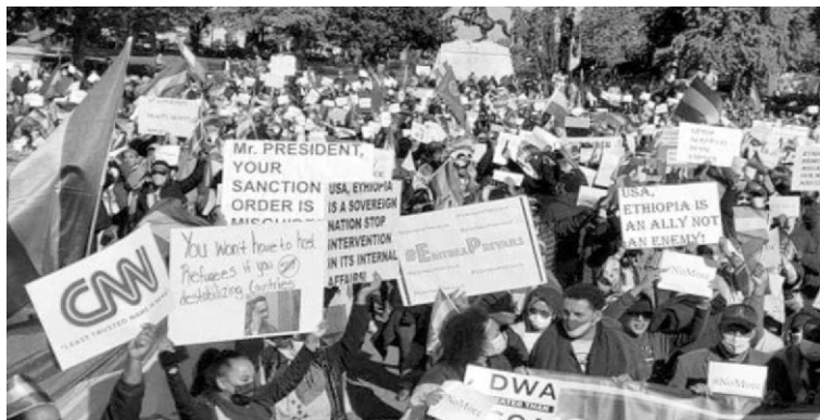
Ethiopians in the US rally in Washington D.C on November 9, 2021, demanding the US and its media to stop backing the TPLF. "Deploing the International community, in particular the UN, United States and the EU Member states, for their continued sympathy" towards the TPLF, the Ethiopian Advocacy Organizations Worldwide (EAOW) passed a resolution calling for peace on September 2

Ethiopian diaspora across the Western world has condemned the US and the EU for "emboldening" the Tigray People's Liberation Front (TPLF) which resumed the war in the northern part of the country on August 24, ending the truce initiated by the federal government in March. "Deploing the International community, in particular the UN, United States and the EU Member states, for their continued sympathy" towards the TPLF, the Ethiopian Advocacy Organizations Worldwide (EAOW) passed a resolution on Friday, September 2. The EAOW, a consortium of 18 organizations representing Ethiopian nationals in the US, Canada, UK, South Africa, and 11 European countries, condemned the TPLF's alleged