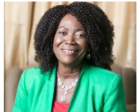
Della Adwoa Sowah, MP for Kpando

The National Democratic Congress (NDC) Member of Parliament (MP) for Kpando Constituency in the Volta Region, Mrs. Della Adwoa Sowah, has called for a united front to retain Kpando parliamentary seat in the general elections of 2024. The NDC guru said political character assassination, sabotaging and backbiting is not in the interest of the party.