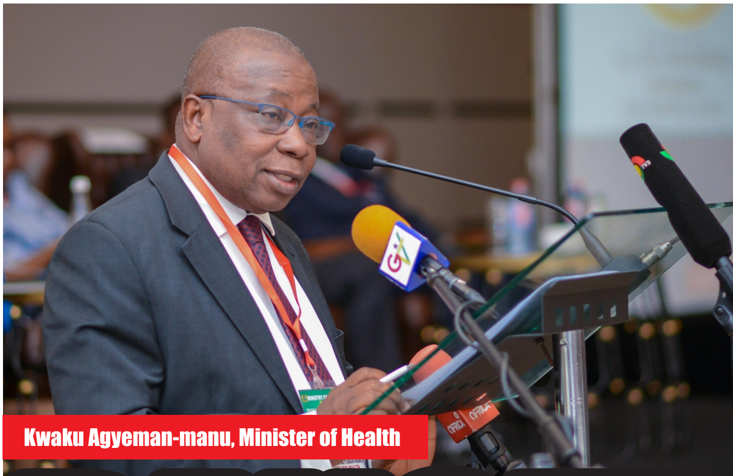
Kwaku Agyeman-manu, Minister of Health