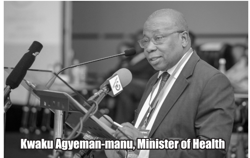
Kwaku Agyeman-manu, Minister of Health

He was of the view that should this happen, the ordinary person on the street will find it difficult to access over-the-counter drugs