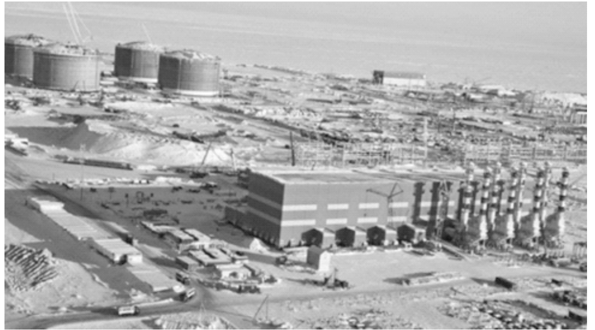
As countries around the world compete for LNG shipments, the setting is favorable for India to work on a gas pipeline project from Russia

On the other hand, according to a recent estimate in July by the International Energy Agency, Russian pipeline gas exports to the EU will fall by over 55% between 2021 and 2025 – perhaps, in an accelerated case, by over 75%. This becomes an extremely favorable setting for India to work on a gas pipeline project from Russia. Significantly, last Tuesday, the prominent Russian daily Nezavisimaya Gazeta carried a report on the visit by the Russian gas Leviathan Gazprom's CEO Alexey Miller to Ashgabat and his meeting with Turkmenistan President Serdar Berdimuhamedov, which inter alia flagged that a pipeline project to send Russian gas to the South Asian region would be under consideration in Moscow. By the way, for the benefit of the uninitiated, following the transition in leadership in Turkmenistan in March, the Moscow-Ashgabat strategic axis has had a phenomenal makeover. On Monday, in Moscow, President Putin conferred Russia's high honor of the Order of Merit of the Fatherland on Berdimuhamedov in a symbolic gesture signifying the Kremlin's great appreciation for Turkmenistan's gesture of spurning an overture from Brussels seeking additional gas supplies for the EU via