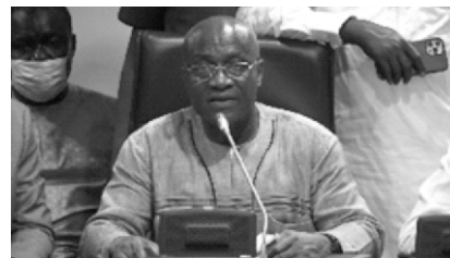
Osei Kyei-Mensah-Bonsu is the Majority Leader in Parliament

T he Majority Leader in Parliament, Osei Kyei-Mensah-Bonsu , has alleged that some chiefs are benefiting from the proceeds of galamsey in parts of the country. He argued that all chiefs who are in these mining areas are in the know about the various galamsey activities going on within their catchment areas. According to him, the leadership of these illegal activities often pay homage to the chiefs before they proceed to mine, insisting that none of the traditional leaders can deny knowledge of galamsey activities in their areas. Speaking in an interview with Oyerepa TV, the Suame legislator charged the government to ensure that it cuts off Common Funds to the MMDAs where galamsey is