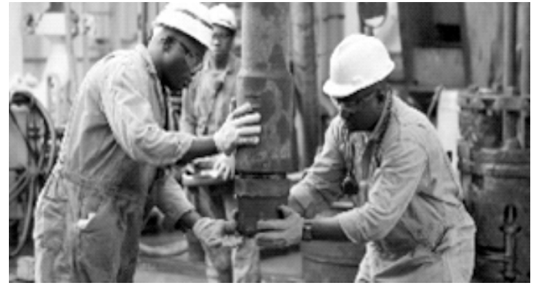
File photo of rigmen on an oil rig

improvement in operational efficiency. It also stated that a total amount of $2.57 million remained outstanding from surface rentals as of December 31 2021. "We noted that a total amount of $2.57 million (2020: $2.11 million) was still outstanding from surface rentals as of 31 December 2021". Meanwhile, some eight defaulting companies including Swiss African Oil Company, Britannia –U and GOSCO Limited are indebted to the