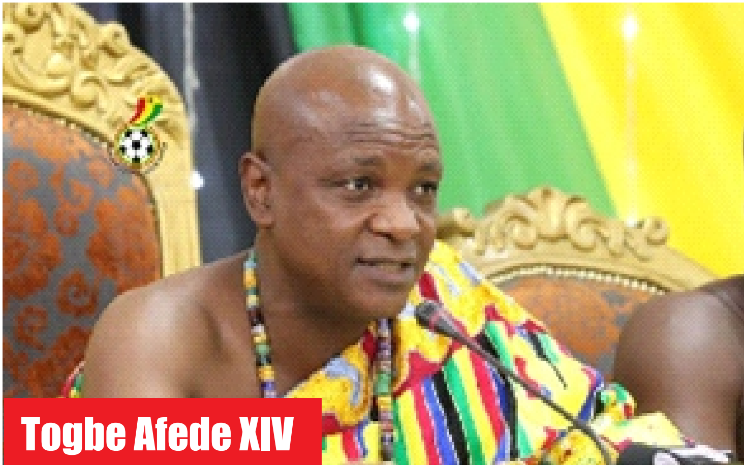
Togbe Afede XIV

He Says Squandering State Funds Now An Acceptable Phenomenon