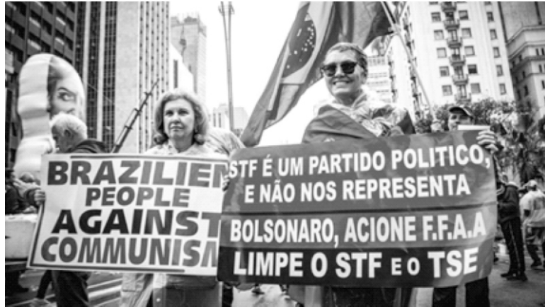
Bolsonaro supporters on September 7 in São Paulo. In the lead-up to the general elections in Brazil, the far-right has intensified its campaign of hysteria and fear-mongering instead of providing concrete solutions to the crises affecting the people

Despite having won the presidential elections in October 2018, Bolsonaro alleged that he was robbed of a first