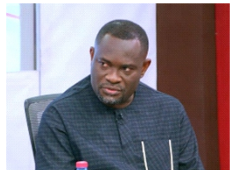
John Ampontuah Kumah, Deputy Minister for Finance

T he Civil and Local Government Staff Association of Ghana (CLOGSAG) has described as untenable the explanation by a Deputy Minister for Finance on the payment of over GHC1.1 million as salaries to some 3 individuals described as 'ghosts' by the Auditor General. According to CLOGSAG, John Kumah Ampontuah's attribution of the