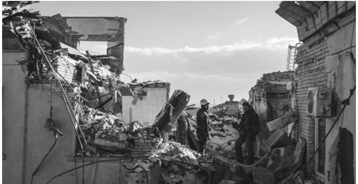
Firefighters in Kharkov in March. Make no mistake, the battle for Donbass still remains the number one priority for the Russian special military operation

In reality, Kharkov Region has been largely a sideshow so far. The fact that there are no plans to hold any referendum in Kharkov — unlike in Kherson and Zaporozhia in the south in early September (which now stands postponed) — speaks for itself.