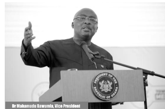
Dr Mahamudu Bawumia, Vice President

"Because for now, Bawumia has failed, he has failed the economy, now we know what he can do, the only thing he can do is start going round, start meeting people and talking about digitalization. He can't