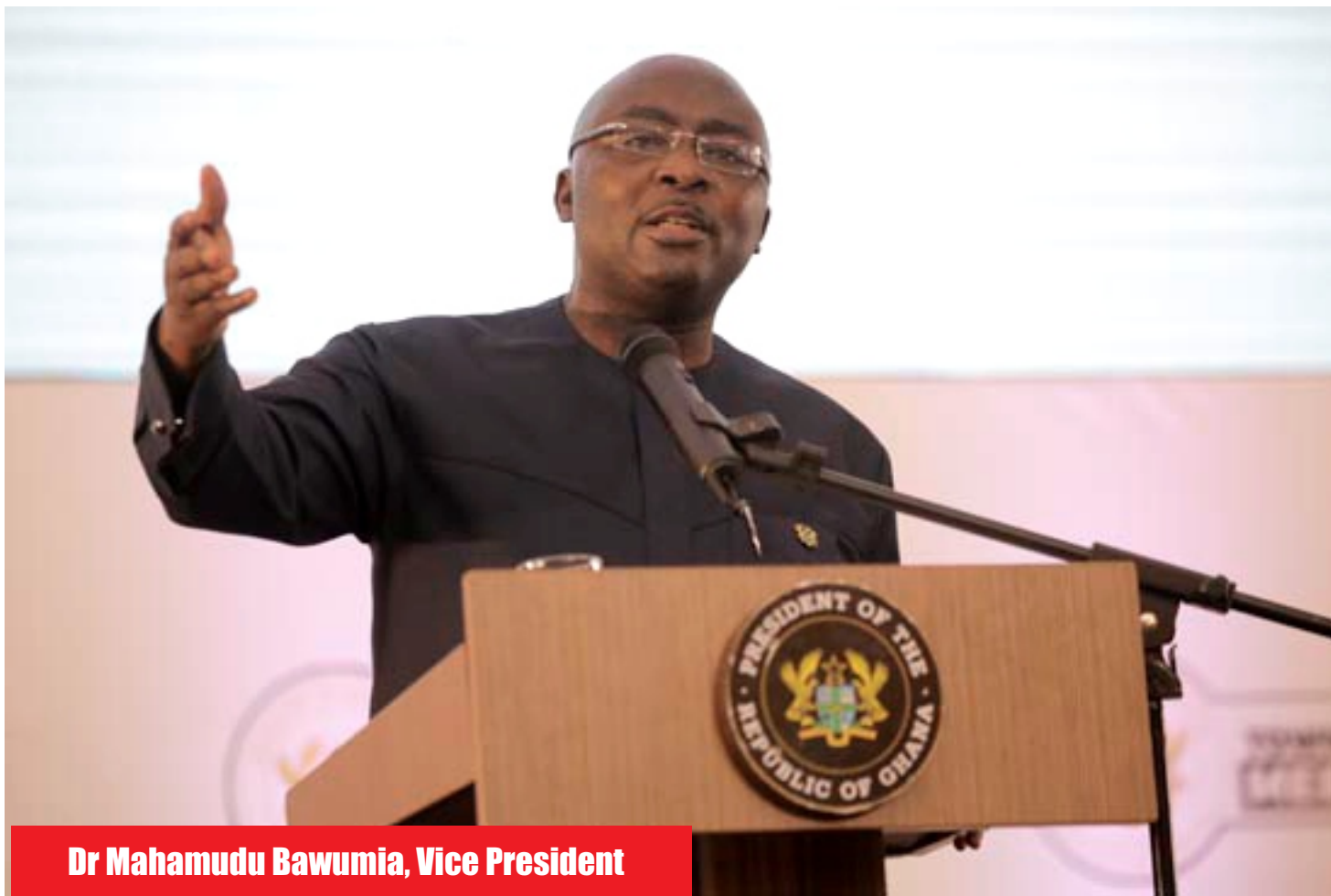
Dr Mahamudu Bawumia, Vice President

Spare Parts Dealers Attack Bawumia; Say Ghana Needs Better Economist