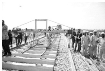
File of the Tema-Mpakadan railway line

The Tema-Mpakadan Railway project will cover about 90