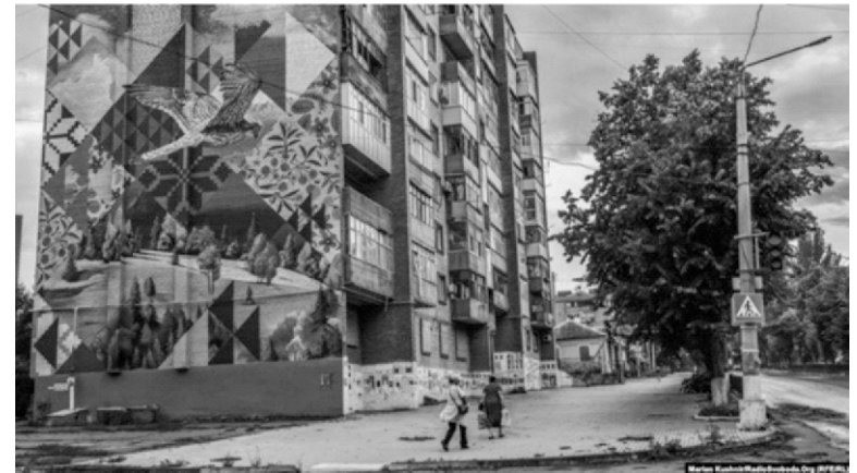
Bakhmut's desolate streets where intense fighting is expected. As calls by “angry patriots” in Russia for a stronger response rise in volume, the latest situation around Bakhmut in Donetsk assumes particular significance

combining their offense with maneuver. The Ukrainian offensive in Kharkov was planned as a flank attack to encircle and destroy the Russian groupings in the area of Balakleya, Kupyansk, and Izyum. But the Russian command anticipated such an attempt, as its frontline had thinned out lately. The Ukrainian forces outnumbered the Russians by almost four to five times. Interestingly, in anticipation of a Ukrainian offensive, civilians who agreed to leave the region for Russia were evacuated from the threatened settlements in military convoys. Using mobile defense tactics under the cover of specially organized units, Russians finally succeeded in withdrawing their forces. In effect, the Ukrainian/US/NATO plan to maneuver a flank attack and encircle the Russian troops was thwarted with minimal losses. On the other side, Ukrainians also admit that Russians inflicted significant losses of manpower on their opponents (who included a big chunk of fighters from NATO countries.) But the Russian military also made mistakes. Thus, their forward positions were not mined — inexplicably enough; frontline intelligence gathering was deficient; and, the residual Russian troops (drawn down to one-third of full strength) were not even equipped with anti-