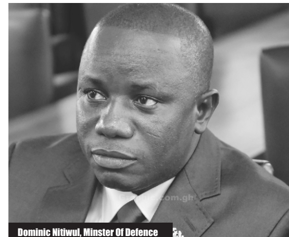
Dominic Nitiwul, Minister Of Defence

also being refurbished. The Insight has learnt that a Navy Forward Operating Base and Barracks is also under construction in the Western Region and is meant to protect Ghana's oil fields. In total 15 Forward Operating Bases are being constructed throughout the country. Under the modernization programme, 366 cadets are also currently under training at the Ghana Military Academy.