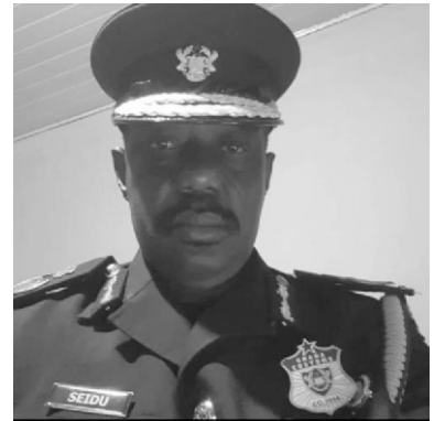
Akans to be in charge of key positions.