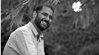
Egyptian political prisoner Alaa Abdel Fattah. Rights groups have accused the Abdel Fattah al-Sisi-led regime in the country of pursuing a policy of deliberate negligence when it comes to the condition of prisons, which are overcrowded due to the state crackdown on political opponents