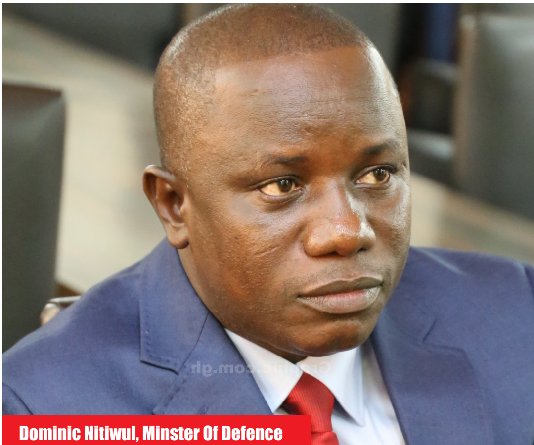
Dominic Nitiwul, Minister Of Defence

T he Ghana Armed Forces is on the verge of buying a new aircraft as part of effort to modernize. Sources close to the Chief of Defence Staff say that arrangements are being made for the training of pilots and technicians who will man the aircraft. The source refused to indicate the type of aircraft which will be bought but said this is in addition to the refurbishment of the K-8 and other helicopters. The Casa aircrafts are