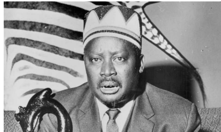
Special unit spread fake news about leftist politician, Oginga Odinga, seen as threat to British interests in 1960s. Kenyan vice-president Oginga Odinga, pictured in 1969, was a major figure in the struggle against British colonialism.