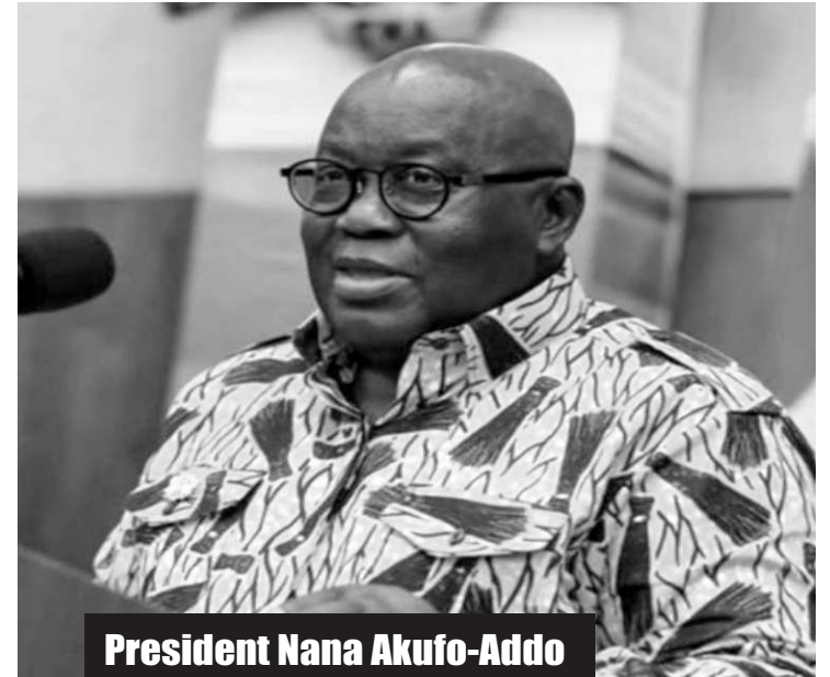
President Nana Akufo-Addo

NPP government and President Akufo-Addo to do the needful by fixing their roads and bringing other development to the Constituency else they will vote based on development in the coming elections. As at the time of going to press, neither the Municipal Chief Executive nor the Member of Parliament (MP) for the area were available for their reactions to the chief's concerns.