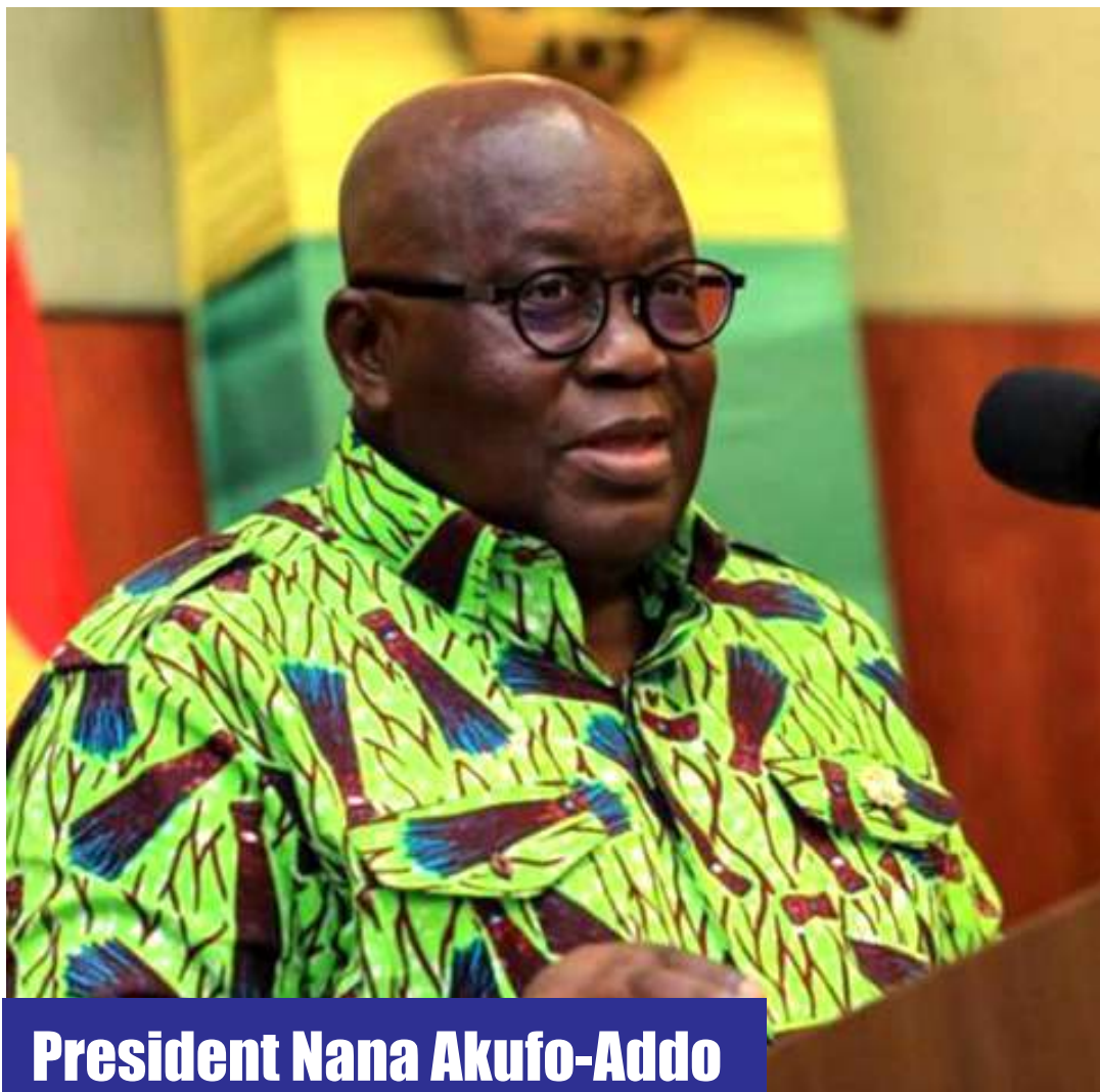
President Nana Akufo-Addo

Over Neglect And Lack Of Developmental Projects