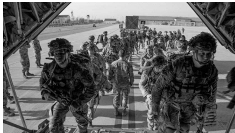
US troops are deployed to Europe amid escalating tensions between Russia and Ukraine before the outbreak of war. The strategists of the hegemonic country of the West, the US, without realizing the flagrant contraction, show unlimited ambition.

around $10 billion —a distant country of which little will remain if the war continues for a long time?