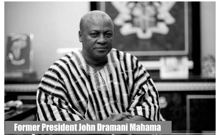
Former President John Dramani Mahama

Among others, that the Finance Minister be sacked and the Economic Management Team, EMT, headed by Vice President Bawumia be disbanded and reconstituted. Government on July 1 initiated talks with the International Monetary Fund, IMF, for an economic rescue programme of about US$3 billion in support.