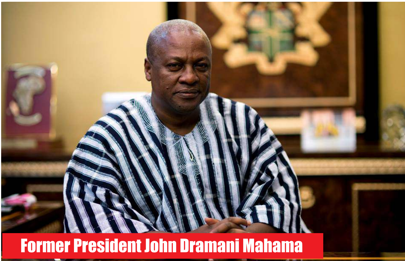
Former President John Dramani Mahama