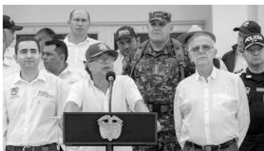
The government of President Gustavo Petro is willing to negotiate peace agreements with all paramilitary groups to achieve total peace in Colombia. President Gustavo Petro stated that the violence must end in the country and reiterated his government's commitment to achieve total peace

A security delegation of Colombian President Gustavo Petro was last Wednesday attacked with firearms in the Catatumbo region on the border with Venezuela, where the president planned to travel this Friday to attend a Security Council meeting. The advance security team had traveled to the Norte de Santander department to verify the route and area to avoid any