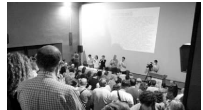
The Union of Socialist Forces has resolved to end the conservative regime in Turkey led by Recep Tayyip Erdoğan and his right-wing Justice and Development Party (AKP). The new alliance, the Union of Socialist Forces, has resolved to put an end to the conservative rule in Turkey led by Erdoğan and the AKP, as well as defend secularism and withdraw from NATO