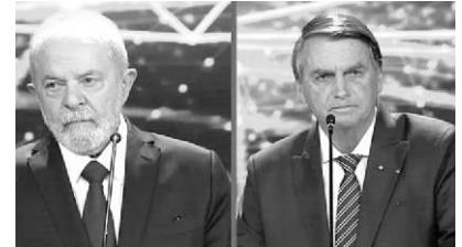
Lula (left) and Bolsonaro dueled in the first block of the debate. Bolsonaro's misogyny and insensitivity to the pandemic were central themes in the

President Jair Bolsonaro attacked journalist Vera Magalhães and candidate Simone Tebet during the debate. When asked about the disinformation spreading against COVID-19 vaccines, Bolsonaro reacted furiously. "Over the past few years, vaccination coverage has been falling. How much did