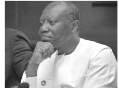
Finance Minister Ken Ofori-Atta