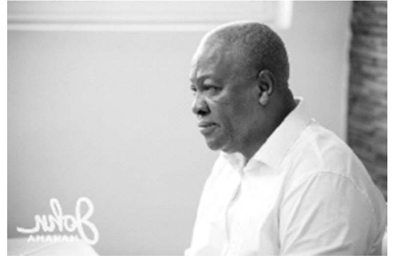
Former President John Dramani Mahama