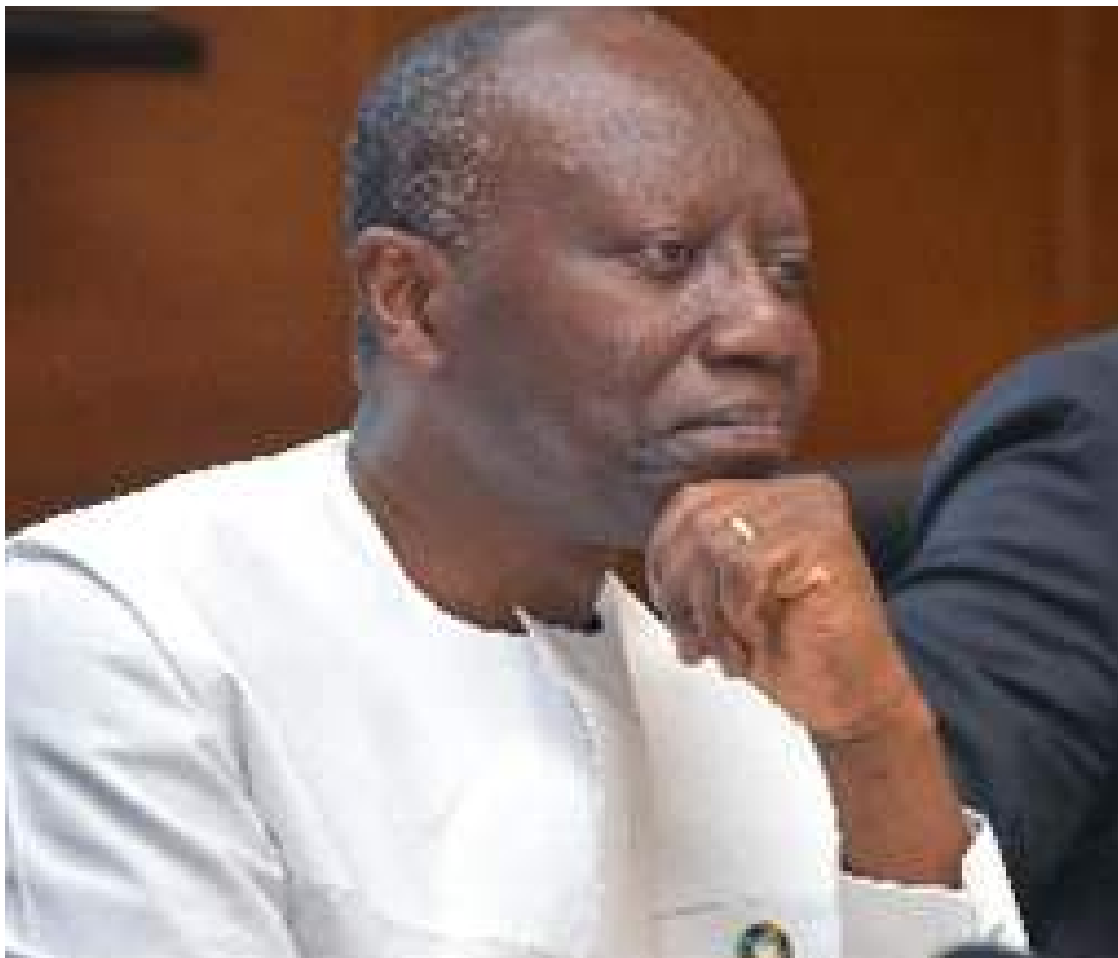
Finance Minister Ken Ofori-Atta

A-G Report Reveals Chilling Details Of Payroll Fraud, Massive Financial Irregularities