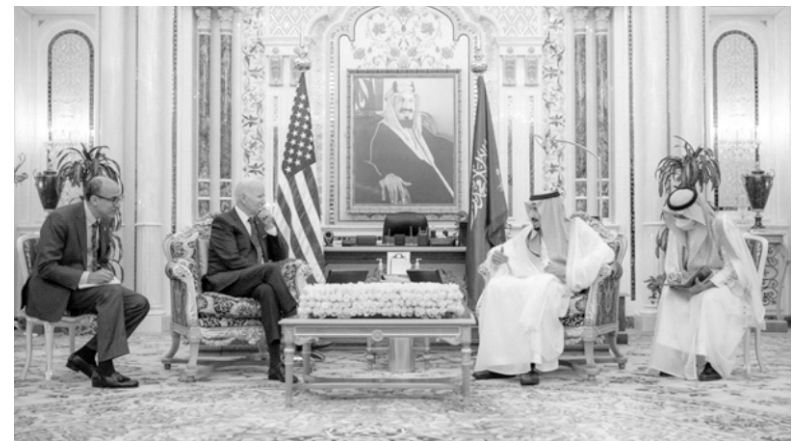
Saudi Arabian King Salman bin Abdulaziz Al Saud with US President Joe Biden at Al-Salam Palace in Jeddah, on July 15, 2022.. The US announced the sale of over USD 5 billion worth of weapons to Saudi Arabia and the UAE on the same day that the UN announced the extension of the truce in Yemen for two more months

The Biden administration has come under global criticism over its policy on Saudi Arabia in recent times. The US has been one of the main suppliers of weapons and technical support to the Saudi-led coalition in the war in Yemen. According to one estimate , Saudi Arabia alone bought 23% of all weapons sold by the US between 2017 and 2021. After facing global criticism and campaigns to end the US involvement in the war in