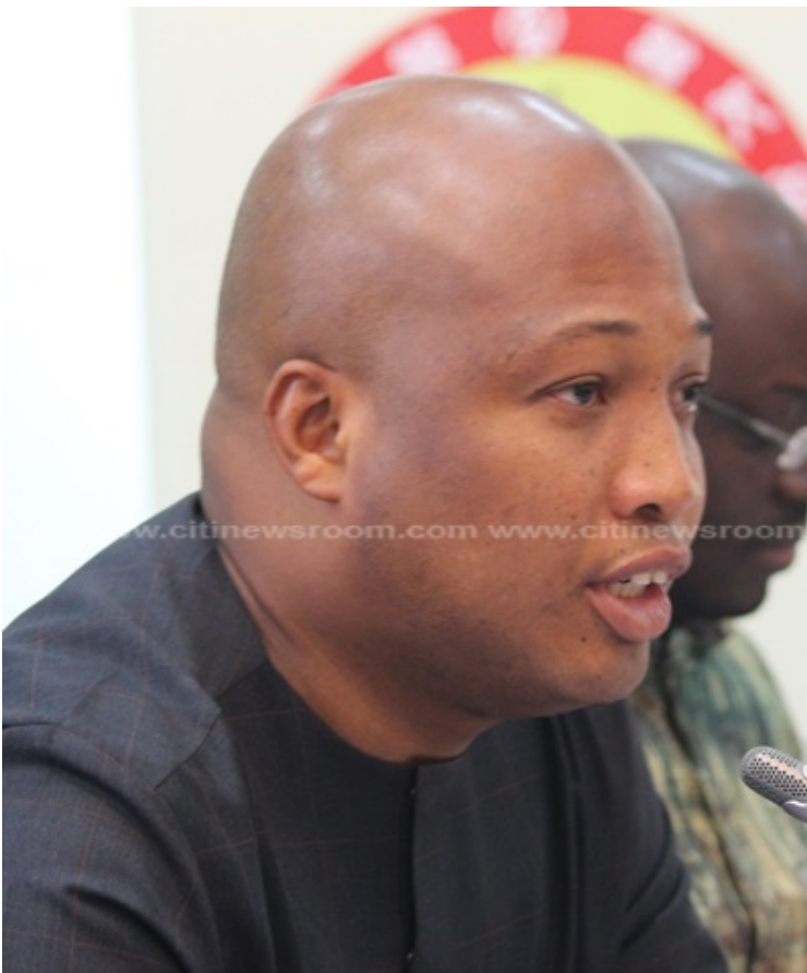
Samuel Okudzeto Ablakwa