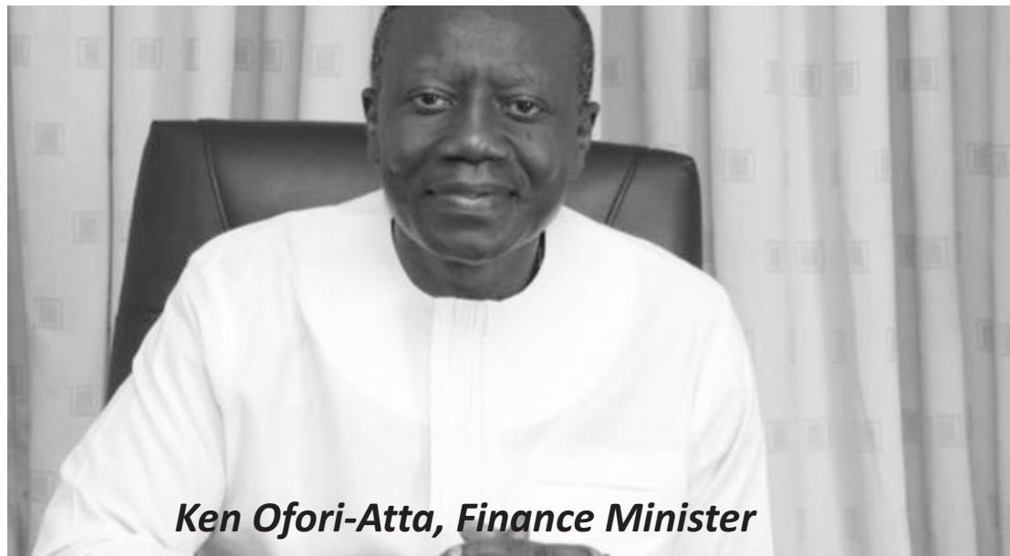
Ken Ofori-Atta, Finance Minister

...Admits Things Are difficult For Ghanaians