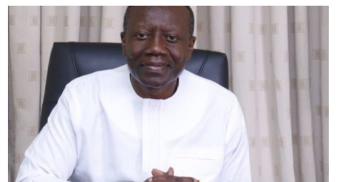
Ken Ofori-Atta, Finance Minister

...Admits Things Are difficult For Ghanaians