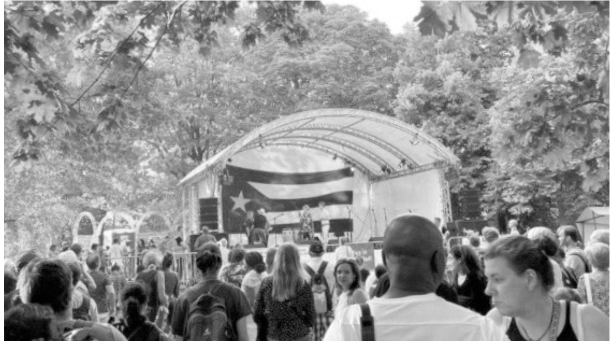
The Fiesta de Solidaridad con Cuba in Berlin was organized by Cuba Sí, a working group from the German leftist party Die Linke, on Saturday, July 23. The gathering combined music, photography, and political activism from Cuba, Latin America, and beyond