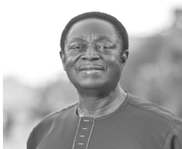
Dr. Kwabena Duffuor is a former finance minister

On arresting the Ghana cedi, reducing inflation, and stabilizing the economy, the former BoG governor suggested that the Central bank leverages gold exports to ease the pressure. "If BoG organizes all the gold exporters, buys off all their gold, even at premium prices, and also gathers the projected data from the gold exporters, there are two things the government can do with it to stabilize our currency" the former governor explained. "Government can sell the gold forward with instruments to bring more dollars into the system. Secondly, the government can use the projected data from the gold exporters for swap arrangements