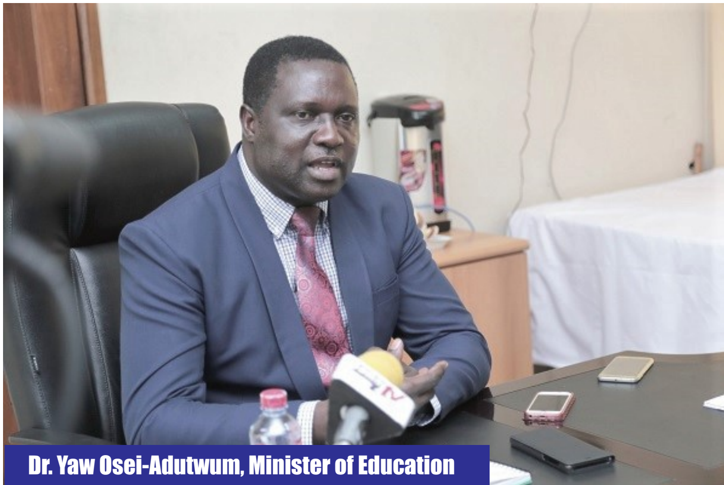
Dr. Yaw Osei-Adutwum, Minister of Education

GNAPS Cries And Accuses Govt Of Sabotage