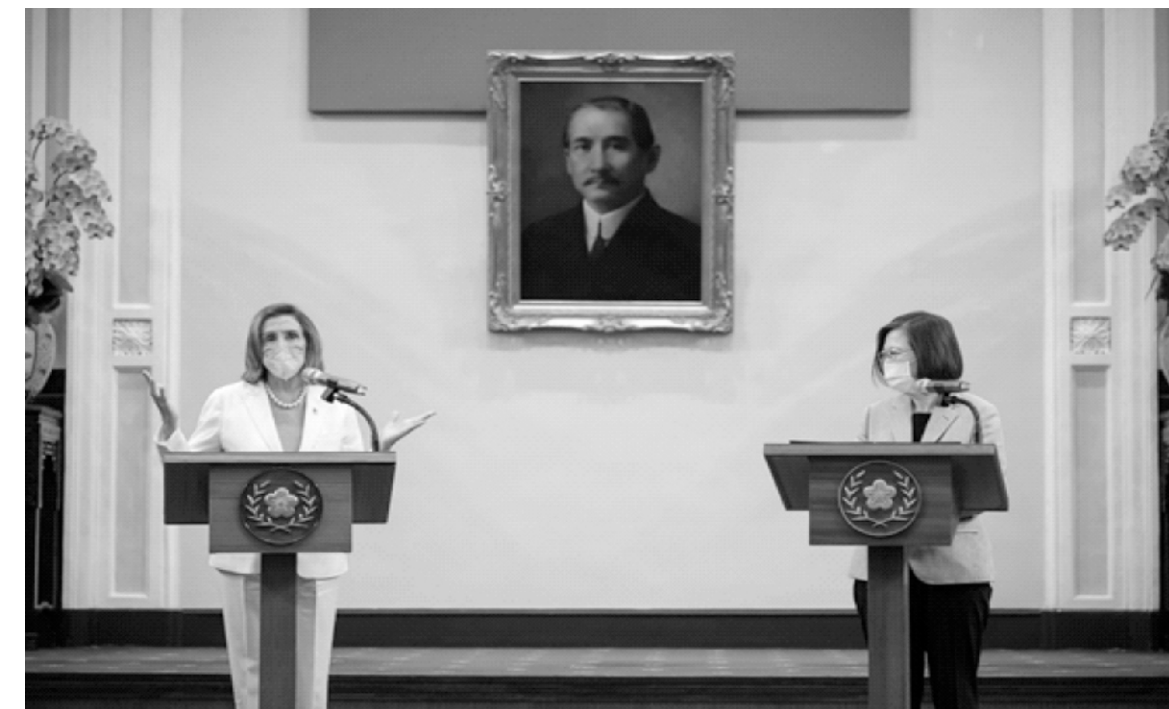
Nancy Pelosi and Taiwan President Tsai Ing-wen. American exceptionalist hypocrisy was on full display during Nancy Pelosi's recent provocative trip to Taiwan.

While Pelosi entered and left Taiwan unscathed, her stunt placed already fragile U.S.-China relations in their worst condition yet. As expected, China took decisive measures in response to the U.S.'s latest and perhaps most provocative violation of the One-China policy to date. The People's Liberation Army conducted three days of military exercises surrounding Taiwan island beginning August 4th, 2022 . China also reduced ties with the United States in eight key areas such as climate change and defense coordination . These measures were derided by National Security Council Spokesperson John Kirby as an attempt to " change the status quo " and "provocative" in nature. For the American Empire, hypocrisy goes hand in hand with endless war. Sending Taiwan, a legally recognized territory of China, tens of billions in