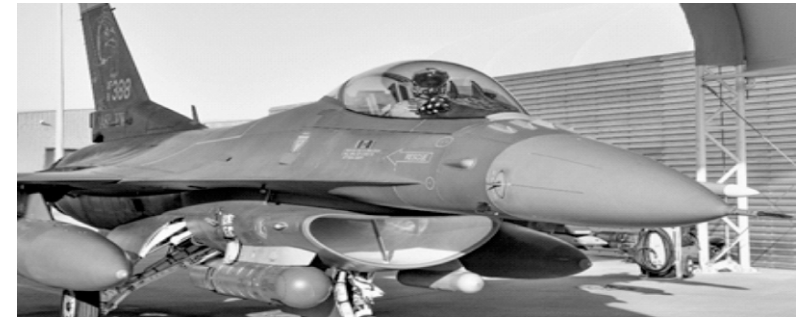
The US Central Command claimed that the airstrikes targeted "Iran backed groups" that were allegedly involved in last week's drone attack on its al-Tanf base in the region

Syria has also accused the US of aiding the anti-Assad forces – Maghawir al-Thawra – and thereby prolonging the war in