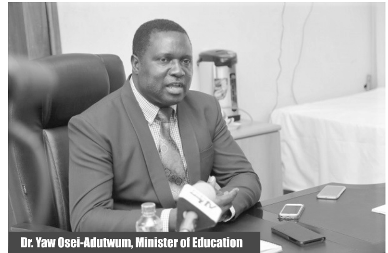
Dr. Yaw Osei-Adutwum, Minister of Education

He, however, said many parents are struggling to pay fees of their wards due to hardship adding some parents