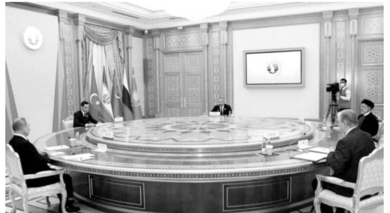
Presidents of Russia, Turkmenistan, Azerbaijan, Iran and Kazakhstan (clockwise from left) took part in the 6th Caspian Summit, Ashgabat, June 29, 2022. A 'Great Game' is afoot in the Caucasus and Central Asia with Russia gaining an advantage due to recent developments in the Ukraine war. The Western powers have belatedly entered the scene too

understood that Russia has outwitted the Western alliance and gained the upper hand in the great game in eastern Black Sea region. So, the Western strategy towards the Caucasus and Central Asia is being reworked. The NATO Secretary-General Jens Stoltenberg scheduled a meeting in Brussels today with the foreign minister of Azerbaijan Jeyhun Bayramov. Importantly, Bayramov also attended a meeting of the EU-Azerbaijan Cooperation Council today in Brussels. The EU foreign policy chief Josep Borrell later said at a joint news conference with Bayramov that “Azerbaijan is an important partner for the European Union and our cooperation is intensifying.” Meanwhile, yesterday, the European Commission President Ursula von der Leyen visited Baku to sign a memorandum of understanding with Azerbaijan on energy cooperation . All this is taking place against the backdrop of Charles Michel, the president of the European Council, spearheading efforts to mediate between arch rivals Azerbaijan and Armenia. As part of the EU's diplomatic efforts, Michel hosted in April a meeting in Brussels between Azerbaijan's President Aliyev and Armenia's Prime Minister Nikol Pashinyan where the two sides expressed willingness to secure a peace agreement. Last week, the CIA Director William Burns paid an unpublicized visit to Yerevan in this connection. Evidently,