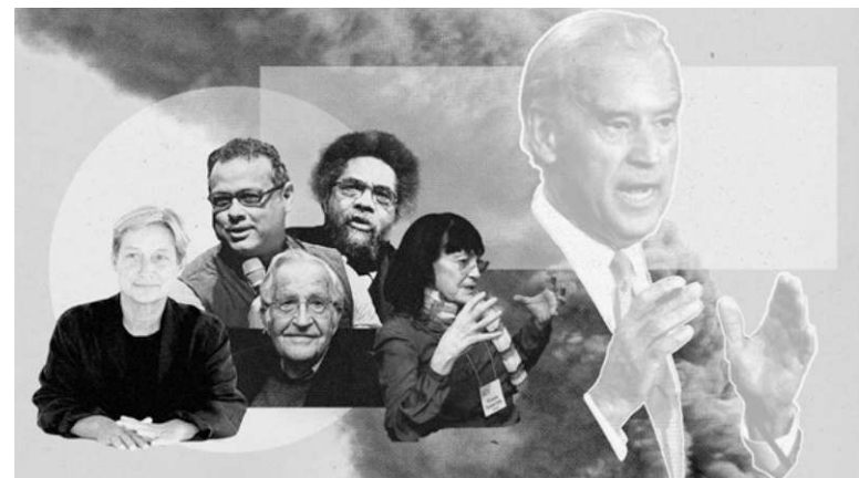
Prominent figures across the US left have signed an open letter demanding that Biden lift sanctions on Cuba to facilitate humanitarian aid after Matanzas fire

“Due to the sanctions, there are long, complex processes to get licenses to send aid, usually taking months for approval,” wrote the