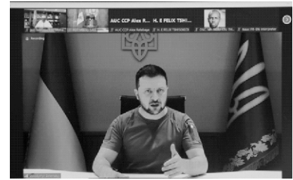
Ukrainian President Volodymyr Zelensky

setback due to the drastic reduction in rights for foreign students in Ukraine. Volodymyr Zelensky's desire to subsequently join NATO created a dilemma for the African countries closest to Russia. In this case Algeria, Angola, South Africa and Equatorial Guinea. But it is especially since the beginning of the conflict between Ukraine and Russia that more and more African diplomats condemn the double standards of treatment of African nationals. Volodymyr Zelensky said in February that any African students who leave Ukraine "will not be welcome there once the war is over". Not to mention, of course, the scandal of the humanitarian corridors. Africans fleeing the war have come up against the European Union's refusal to welcome them on the same basis as Ukrainian refugees. Then, at the end of last February, the Ukrainian embassy in Senegal enlisted several dozen Senegalese to fight in Ukraine. An appeal