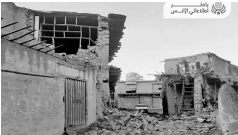
The 6.0 magnitude earthquake struck the provinces of Paktika and Khost. The death toll is expected to rise in the coming days.

A massive earthquake of 6.0 magnitude has killed over 1,000 people in eastern Afghanistan and injured over 1,500, triggering an emergency in the country. On Wednesday, June 22, the Taliban administration's disaster management officials