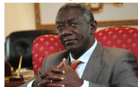
Former President John Agyekum Kufuor

It's Fake News ! Ex-President Kufuor Rubbishes Claims Of Endorsing Bawumia