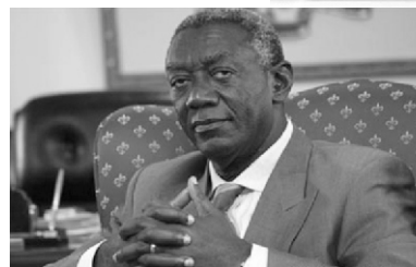
Former President John Agyekum Kufuor

"The President believes that any of those mentioned, when selected by the party to be the flagbearer, would be able to discharge the work of the